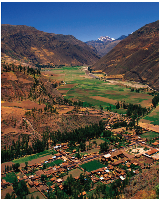
The beautiful and historic Sacred Valley

Day 16: Arrive U.S. We arrive in the U.S. this morning and connect with our return flights home.