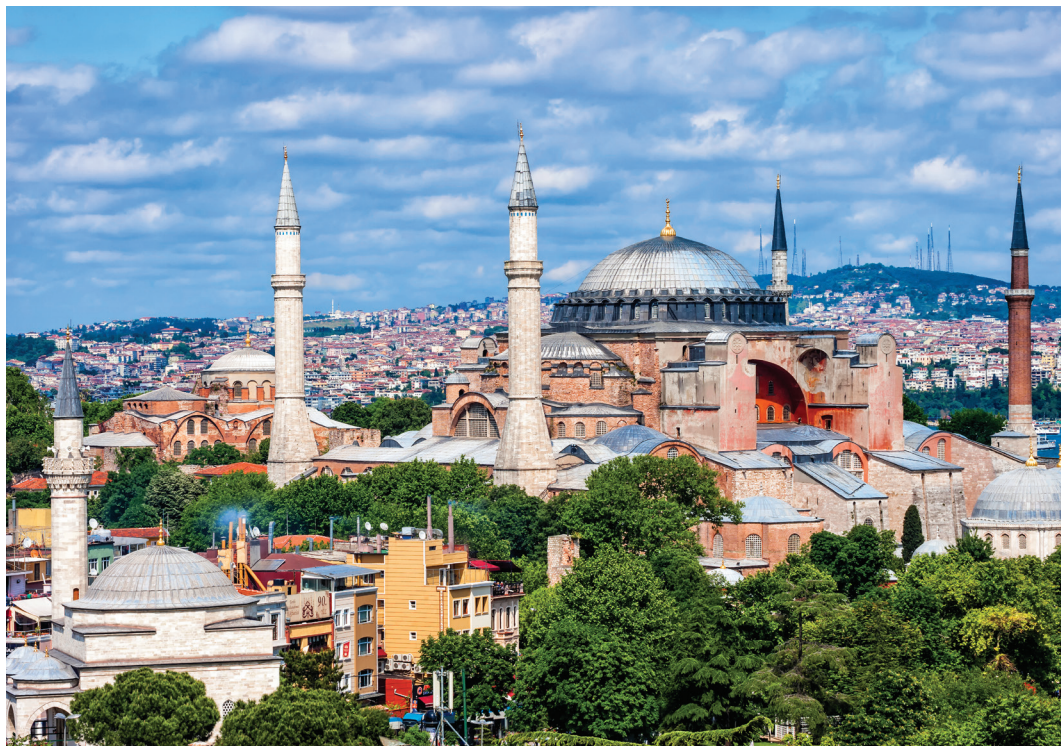
We visit Istanbul's famed 6 th -century Hagia Sophia on Day 4.

Day 6: Istanbul/Gallipoli/Troy/Assos Leaving Istanbul this morning, we travel to the northern Aegean Coast for a brief visit to Gallipoli, haunting site of 31 Allied cemeteries from World War I. Then we ferry across the Dardanelles to Troy, once believed to exist only in Homer's epic poem until the present site was discovered in the 1870s. After touring here we continue south to Behramkale, ancient Assos, where we spend the night. B,L,D