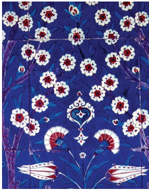
Vibrant Iznik tiles

Day 12: Cruising – Gemiler Island/Kayakoy Today we cruise to Gemiler Island to tour its 6 th -century Byzantine monastery. Then we coach to the Greek “ghost town” of Kayakoy, abandoned after World War I and now preserved as a historical monument. We explore the town and its churches then return to