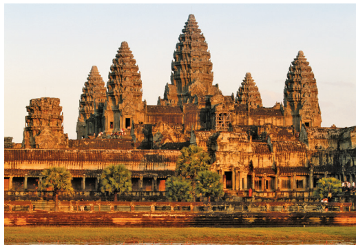
Temple at Angkor Wat, Cambodia

Day 15: Depart for U.S. Today is free to explore Saigon. In the evening, we transfer to the airport for our return flights to the U.S., which will arrive the next day (Day 16). A late hotel check-out will be provided. B