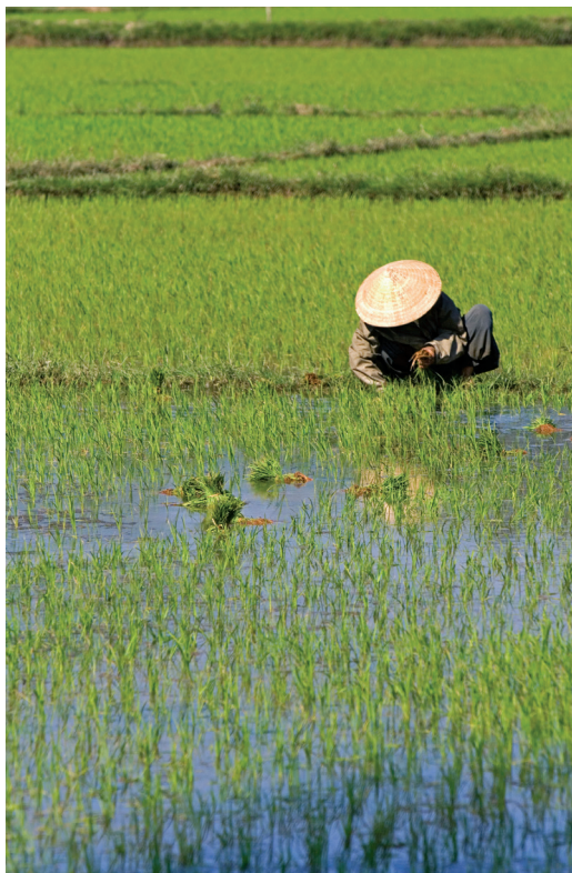
A Vietnamese farmer plants rice.