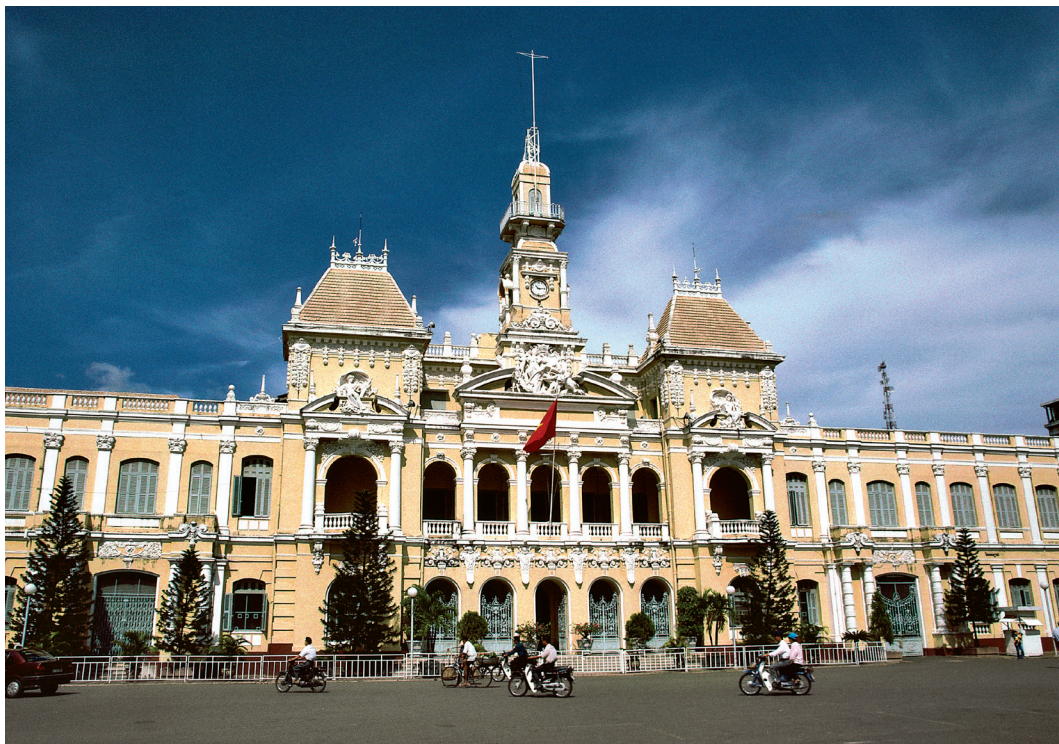
Observe the French architectural influences during a tour of Saigon on Day 13.

resort for a relaxing interlude. Tonight, we enjoy a cooking lesson and dinner in Hoi An. B,D