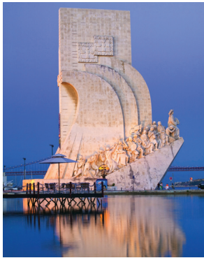
Lisbon’s Monument to the Discoveries

Day 12: Úbeda/Toledo/Madrid A highlight is in store today as we visit Toledo, capital of medieval Spain. Declared a Spanish National Landmark, the city is little changed visually from its 16 th -century days as a subject for the artist El Greco. Toledo boasts an incomparable hilltop setting overlooking the Castilian plains and surrounded on three sides by the Tagus River. After lunch on our own we see Toledo’s most important sights on our guided tour, including the massive Gothic Cathedral. Then we continue on to Madrid, arriving late afternoon. Dinner tonight is on our own. B