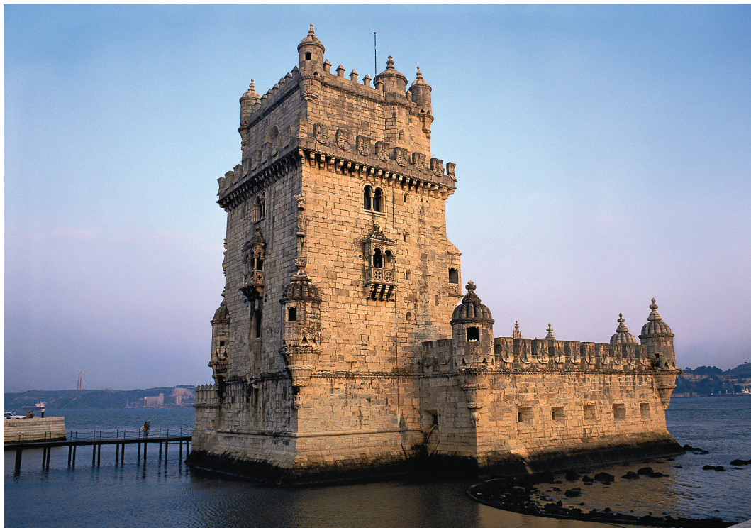
We see iconic Belém Tower, the most photographed monument in Portugal, on Day 3.

Day 7: Carmona/Seville This morning we visit splendid Seville, Moorish capital of Spain's Andalusia region and city of beauty and romance. This is the place that inspired Carmen and Don Giovanni ; where fragrant orange trees and flower-bedecked balconies delight the senses; and home of the renowned Catédral, the world's largest Gothic building. After a tour that includes the Alcázar palace and the Arab quarter, the afternoon is free to explore independently. We return to Carmona late afternoon and dine at our parador this evening. B,D