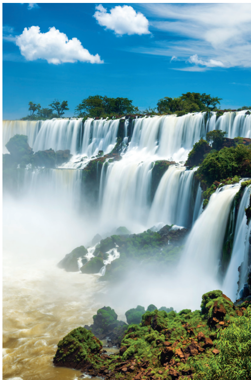
Lush rainforest surrounds Iguazu Falls.