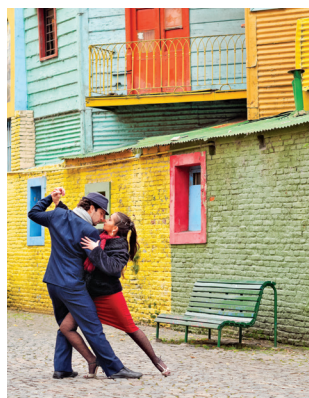
Dancing the tango in La Boca

Day 16: Rio de Janeiro A full day of touring this pulsating city of Carnivale, Bossa Nova, the samba, and stunning natural beauty begins with a visit to Corcovado Hill, the 2,329-foot peak capped by the 125-foot statue of Christ the Redeemer. From the viewing platform, we see glorious panoramic views of the city, Sugar Loaf Mountain, and Copacabana and Ipanema beaches. Tonight we celebrate our journey at a farewell dinner at a local churrascaria , a traditional Brazilian steak house. B,D