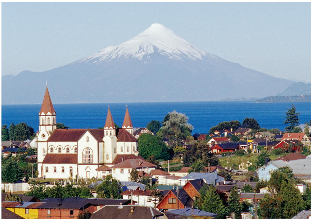
Conical Osorno Volcano, on the shore of Lake Llanquihue

District crossing, boarding a catamaran for the ride across Lake Todos Los Santos, arriving 1½ hours later in Peulla. Here, amidst beautiful natural scenery of Andes peaks and dense forests, this afternoon we enjoy a 4x4 excursion. B,L,D