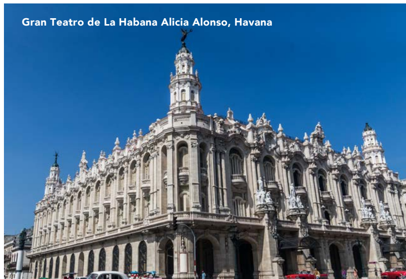
Gran Teatro de La Habana Alicia Alonso, Havana

NOT INCLUDED IN RATE International airfare; Cuban visa; Cuban Departure tax; limited Cuban health insurance policy (required for all foreign travelers to Cuba under age 80); passport fees; alcoholic beverages other than as noted in inclusions; personal items and expenses; travel insurance; excess baggage; airport transfers other than for those on suggested flights; travel insurance; any other items not specifically mentioned as included.