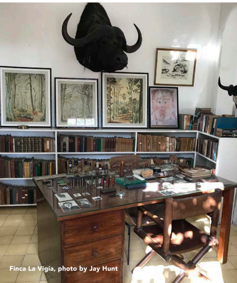
Finca La Vigía