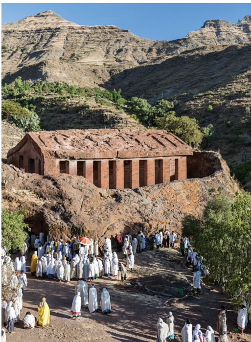
We visit the rock churches of Lalibela on Day 11.