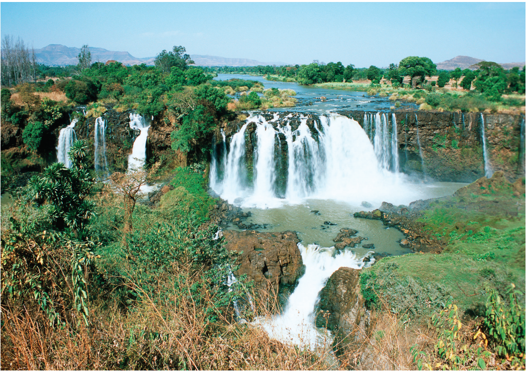
We experience the beauty of Blue Nile Falls in Bahir Dar on Day 5.

of castles, palaces, and stables of Fasil Ghebbi, now a UNESCO site. We also tour the Debre Berhan Selassie Church, fancifully decorated in murals whose angels' faces have become motifs of Ethiopian art and design. B,L,D