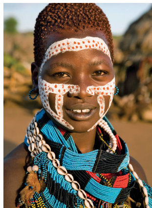
Hamar tribe member (optional extension)

decorated with elaborate carvings and murals. B,L,D