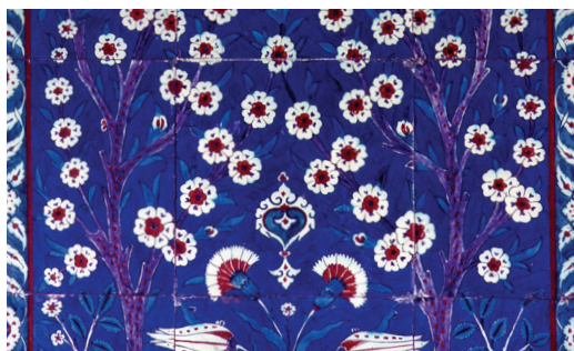
Exquisite Iznik tiles

Day 15: Depart for U.S. This morning we board an early flight for our return to the United States. B