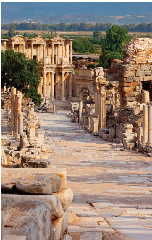
On Day 8 we visit the impressive ruins at Ephesus.