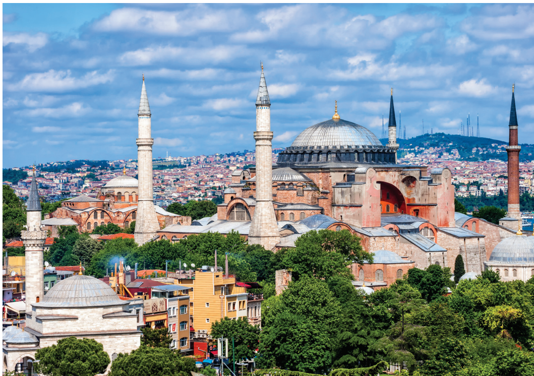
We visit Istanbul's famed 6 th -century Hagia Sophia on Day 4.

Day 6: Istanbul/Gallipoli/Troy/Assos Leaving Istanbul this morning, we travel to the northern Aegean Coast for a brief visit to Gallipoli, haunting site of 31 Allied cemeteries from World War I. Then we ferry across the Dardanelles to Troy, once believed to exist only in Homer's epic poem until the present site was discovered in the 1870s. After touring here we continue south to Behramkale, ancient Assos, where we spend the night. B,L,D