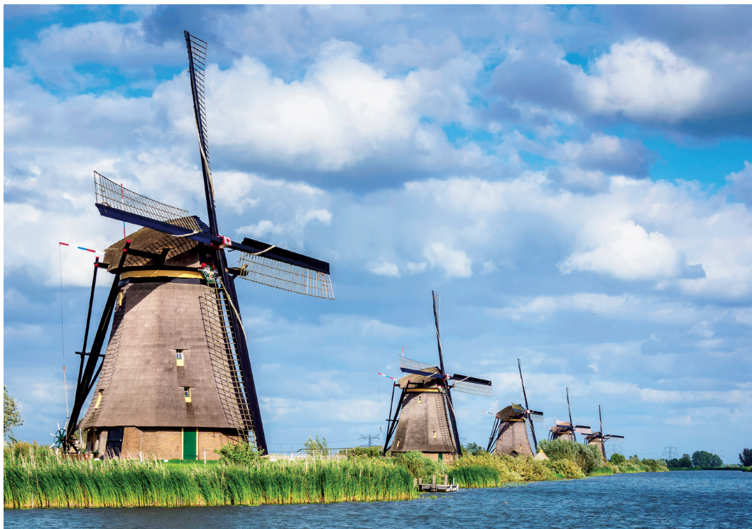
We see the 19 windmills of Kinderdijk on Day 5.

private cruise along the city's romantic canals. After lunch on our own, the remainder of the afternoon is ours to do as we wish in this beloved city. We meet up tonight for dinner together at a local restaurant. B,D