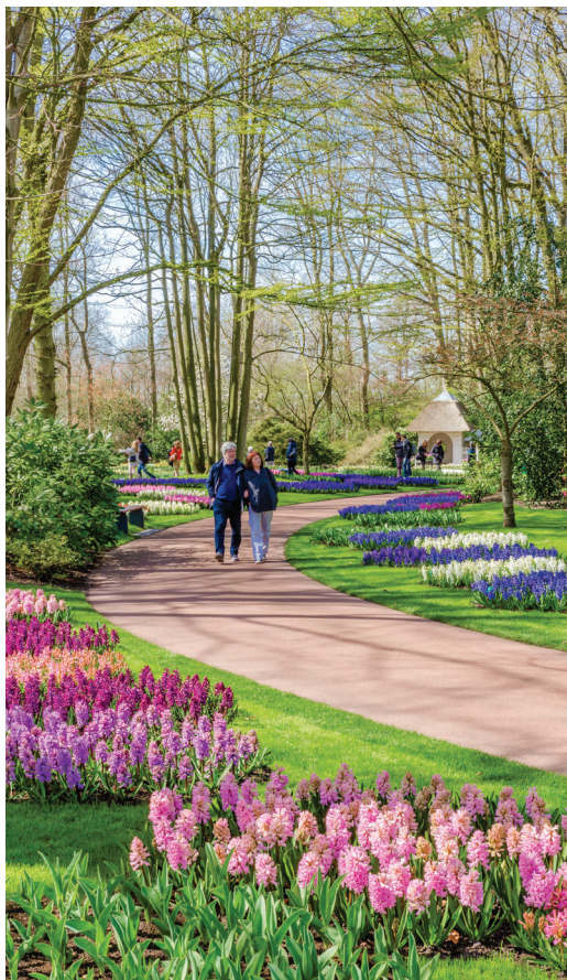
Spring flowers in bloom at Keukenhof

Day 12: Depart Paris for U.S. We transfer to the airport this morning for our return flight to the United States. B