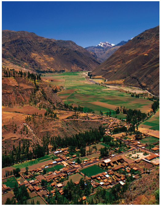
The beautiful and historic Sacred Valley

Day 16: Arrive U.S. We arrive in the U.S. this morning and connect with our return flights home.