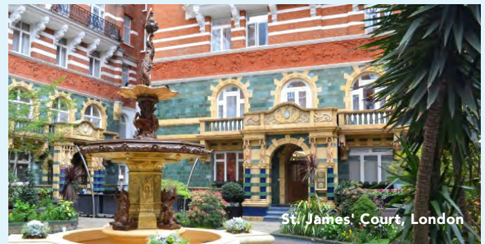
St. James' Court, London

A discreet Victorian masterpiece, the St. James' Court Hotel typifies the veiled charm of one of Britain's finest luxury hotels. Delight in its complimentary Wi-Fi, tailored treatments at the Wellness Centre, and a host of on-site dining options.