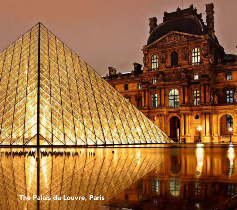
The Palais du Louvre, Paris