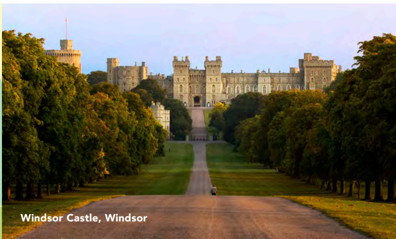
Windsor Castle, Windsor

This itinerary is subject to change at the discretion of the Virginia Museum of Fine Arts and Arrangements Abroad. For complete details, please carefully read the terms and conditions at www.arrangementsabroad.com/terms .