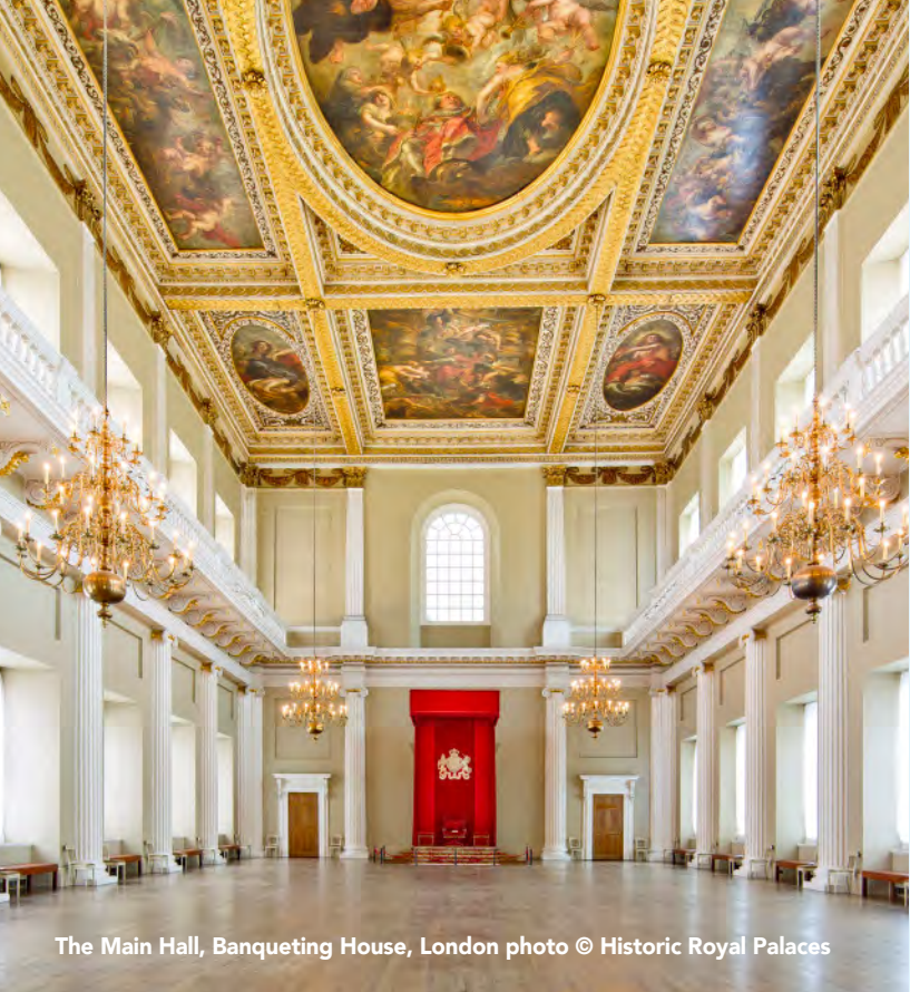
The Main Hall, Banqueting House, London