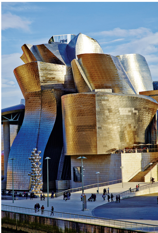
Bilbao’s iconic Guggenheim Museum