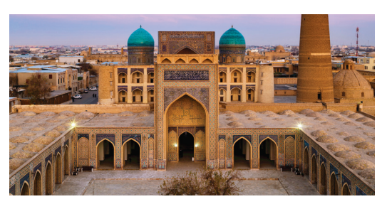
Cityscape of Bukhara

Pennsylvania, and a BA in art and architectural history from Wesleyan University. A specialist in medieval and early modern South Indian art and architecture, his first task at VMFA was to lead the reinstallation of its world-class South Asian and Himalayan collections in five new galleries.