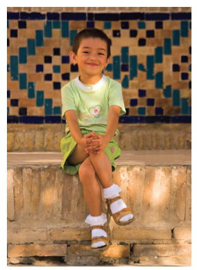
Young Uzbek girl

Day 14: Tashkent A morning tour of Uzbekistan's capital begins in the Old City at the Khazrati Imam Complex of mosques and madrassahs. Here we see the world's oldest surviving Islamic holy book, the 8th-century Uthman Quran, brought to Tashkent by Tamerlane. Next: Chorsu Bazaar, under whose massive green dome locals purchase everything from pro-duce to clothing. After lunch, we visit the studio of renowned ceramicist Akbar Rakhimov. Tonight we enjoy dinner together at a local restaurant. B,L,D