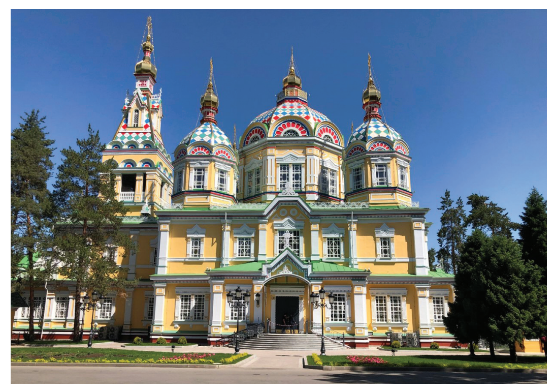
Almaty's Ascension Cathedral, which we visit on Day 16

Day 7: Khiva/Bukhara This morning we journey through the Kyzylkum Desert to Bukhara, with lunch en route. Upon arrival in this ancient city of Silk Road commerce and religious piety, we visit the Chor Minor madrassah, with its four minarets. This evening we dine at Akbar House, the preserved home of a 19<sup>th</sup>-century Jewish merchant. B,L,D