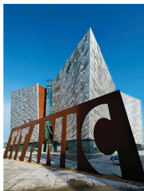
Titanic Museum, optional extension

Day 11: Kilkenny Today is devoted to Kilkenny, a well-preserved medieval city known as Ireland’s cultural capital – and the country’s smallest city. We tour 12 th -century Kilkenny Castle, considered one of the country’s most beautiful, then embark on an informal walking