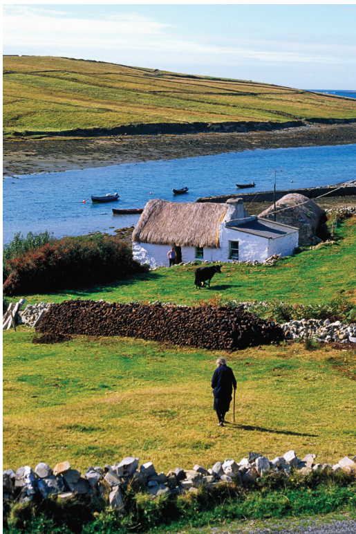
Stone walls wind through the Aran Islands.