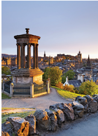
Edinburgh’s Stewart Monument

British monarchs. Then we continue on to London, arriving late this afternoon. Dinner tonight is on our own in this world-class city. B