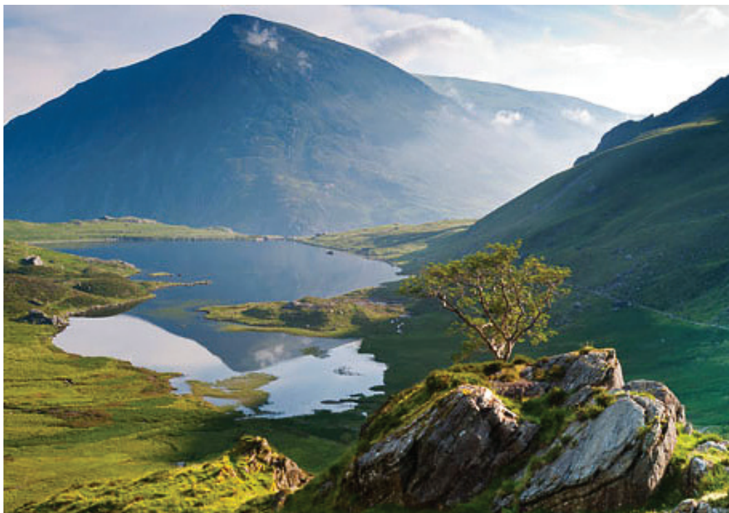
Wales' pristine Snowdonia National Park, which we visit on Day 8

the early 1900s. Late afternoon we return to our hotel and dine there tonight. B,D