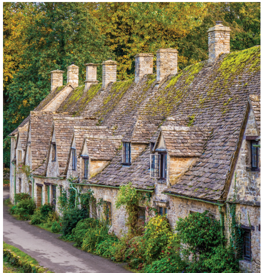
England’s beautiful Cotswolds region