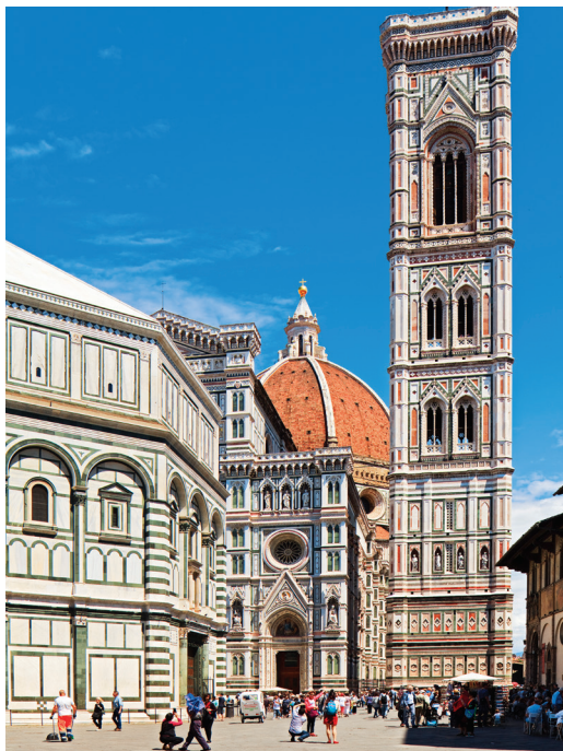
Florence, birthplace of the Renaissance