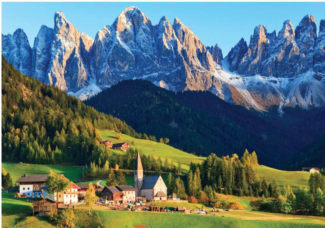
We enjoy stunning scenery in the South Tyrol.

Day 7: Santa Margherita/Cinque Terre/Portovenere We depart this morning by train for the Cinque Terre (literally, “Five Lands”), the five cliff-clinging villages seemingly carved from the mountains. Originally medieval fishing villages, the Cinque Terre were inaccessible by land for centuries. We stop in scenic Vernazza and board a boat for a comfortable cruise along the rugged coastline to visit another village of the Cinque Terre. From here we cruise to the port town of Portovenere, with its cluster of colorful column-shaped houses. After a brief walking tour of the Old Town, we have time to explore and enjoy lunch on our own. We dine together tonight at our hotel. B,D