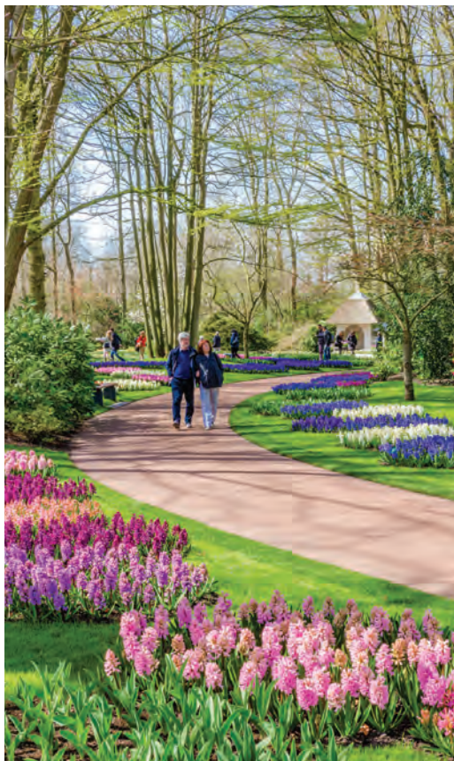
Spring flowers in bloom at Keukenhof

Day 12: Depart Paris for U.S. We transfer to the airport this morning for our return flight to the United States. B