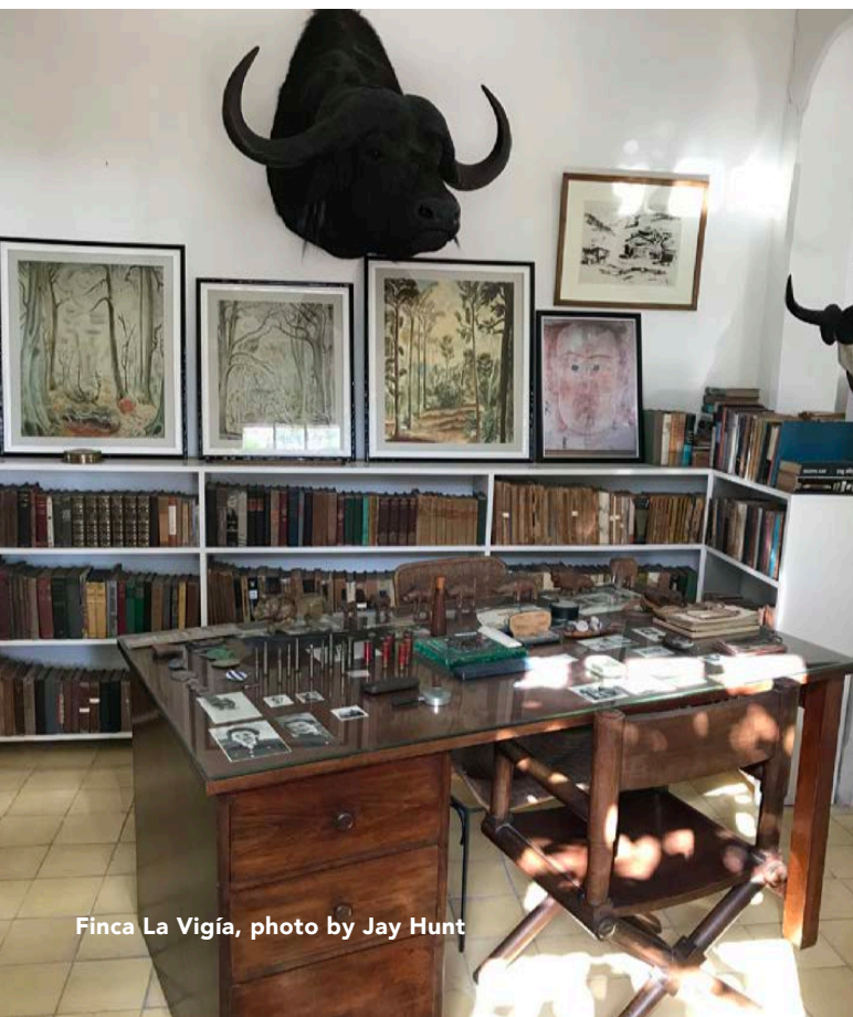
Finca La Vigía