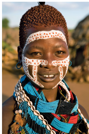
Hamar tribe member (optional extension)

Day 12: Lalibela We get an intimate look at Ethiopian culture today, as we travel about 1½ hours outside the city to the remarkable cave church of Yemrehanna Kristos, set in a cavern and decorated with elaborate carvings and murals. Then we attend a traditional coffee ceremony, a time-honored ritual that reflects traditional hospitality. The country’s major export, Ethiopian coffee compares to the best