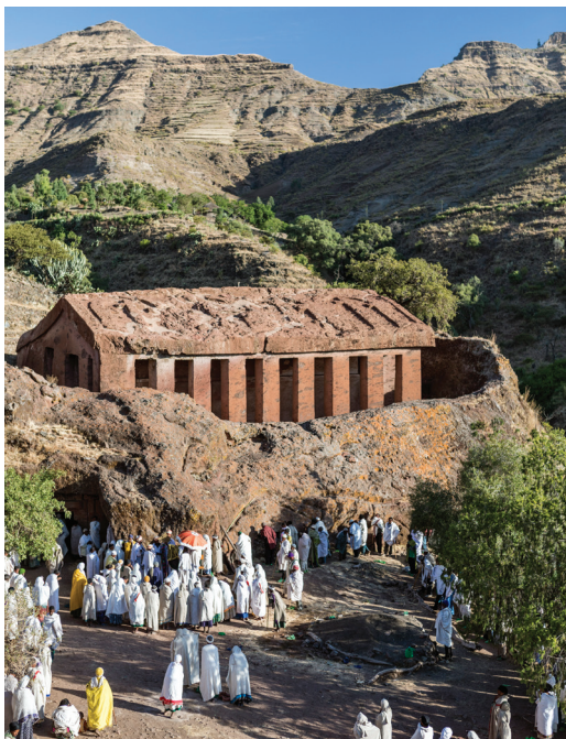
We visit the rock churches of Lalibela on Day 11.