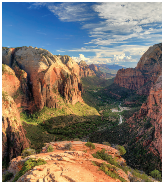
Beautiful Zion vista