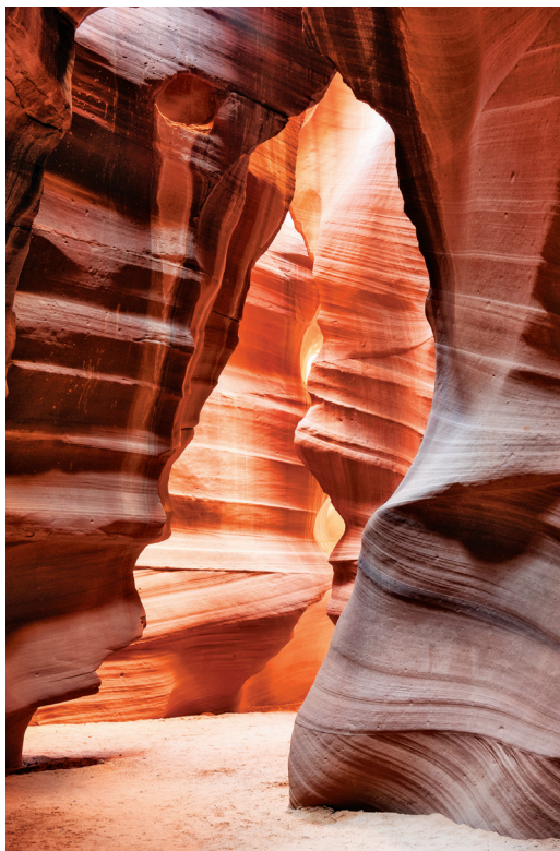
We explore sinuous Antelope Canyon on Day 4.

Day 10: Depart Las Vegas This morning we transfer to the Las Vegas airport for our flights home. B