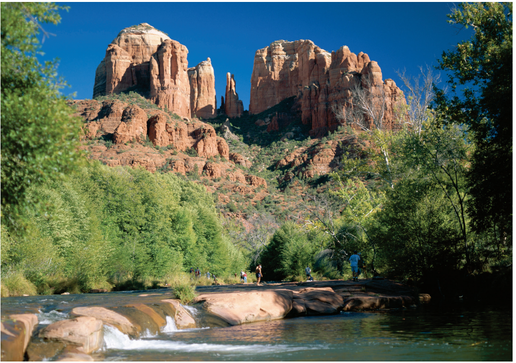
Cathedral Rock is a breathtaking site upon arrival to Sedona.

reservoir, Lake Powell. After reaching Page early this afternoon, we have lunch on our own then visit the sinuous – and spectacular – Upper Antelope Canyon. We travel onto Navajo land to reach this slot canyon, known to local tribes as “the place where water runs through rocks” – and one of the most photographed slot canyons in the world. Our tour through this stunning passageway reveals red-orange walls of “flowing” rock rising to heights of nearly 120 feet – the narrow canyon’s hard edges smoothed away by eons of water and sand erosion. We check in at our lakeside hotel this afternoon then enjoy dinner together there tonight. B,D