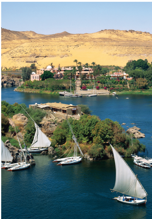
We sail traditional feluccas along the Nile.

Day 15: Depart for U.S. Very early this morning we transfer to the airport for our return flight to the U.S. B