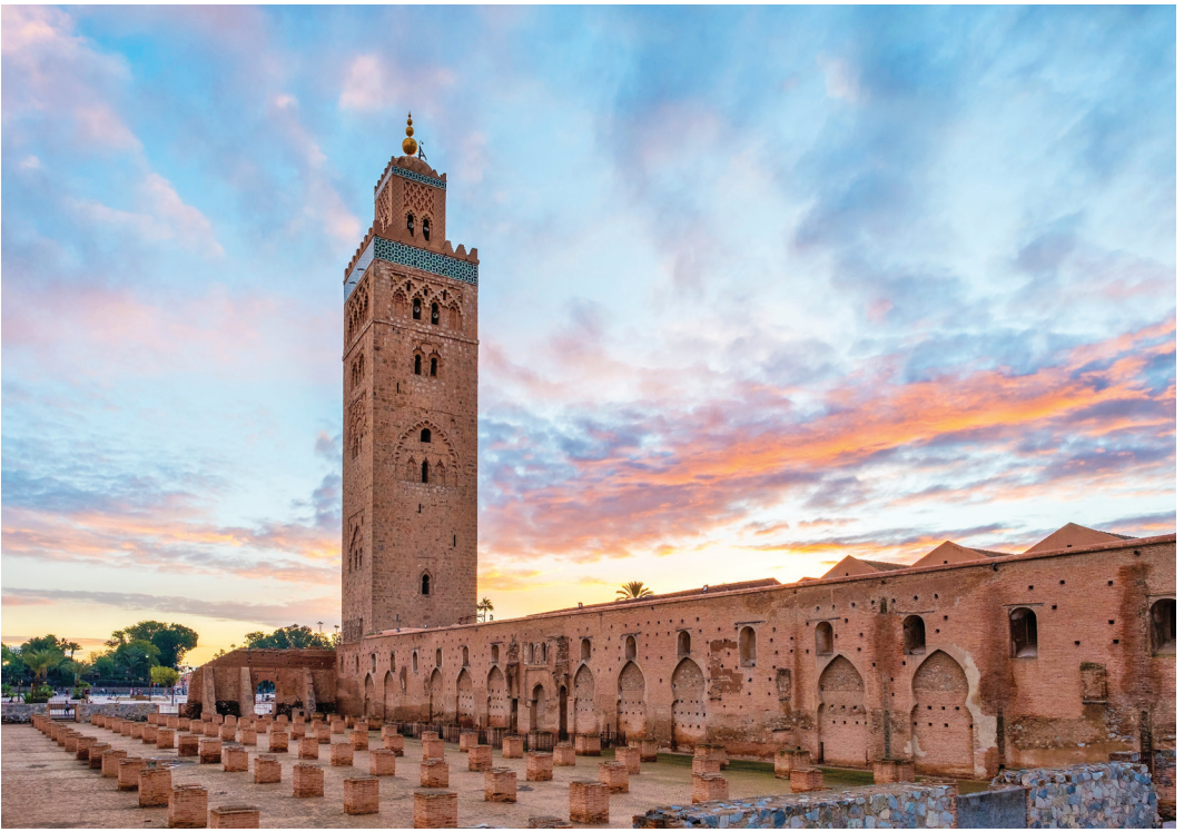
We see the distinctive Koutoubia Mosque – Marrakech’s largest – on Day 11.

Day 6: Fez We begin today with a walk through the medina and a visit to the Al-Attarine Madrasa, whose highlight is a small courtyard showcasing intricately detailed tilework and carving decorations. Then we embark on a walking tour of the medina focusing on the artisans’ quarters, the 14 th -century Koranic schools, and Al Karaouine, the medieval theological university. After lunch on our own, we visit the Borj Nord Arms Museum, an authentic Saadi fort that dates from 1582 and one of Morocco’s only European-influenced forts. After exploring the Moroccan armaments here, we are free this afternoon for independent exploration or relaxation. Tonight, we enjoy a private dinner at an intimate family-run riad in Fez. B,L,D