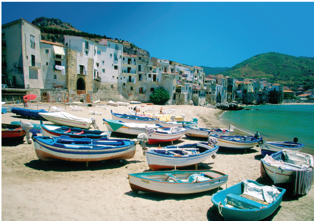
Colorful fishing boats along a Sicilian harbor

Day 6: Taormina/Matera We leave Sicily today for the mainland region of Basilicata, a day-long transfer that includes a ferry ride from Sicily to Calabria. Late this afternoon we reach Matera, whose historic troglodyte churches and dwellings ( Sassi ) have been designated a UNESCO site and where our hotel is a renovated cave dwelling in the city's historic district. B,D