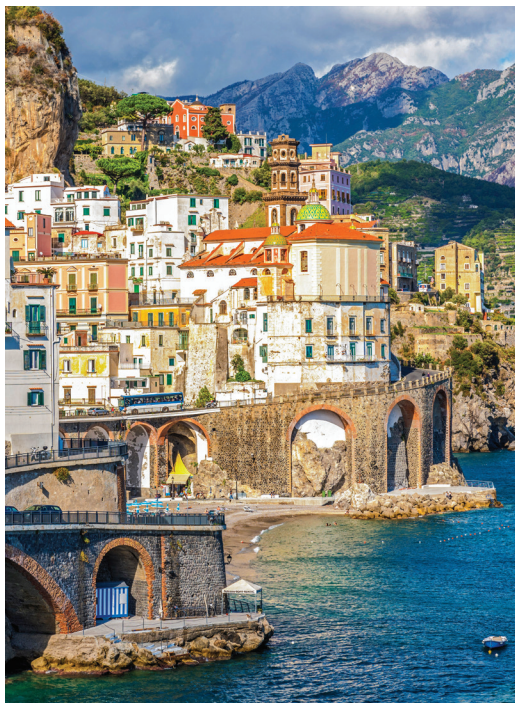
The stunning Amalfi Coast has drawn visitors for centuries.