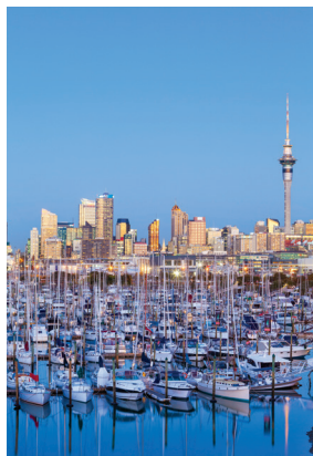
Auckland, City of Sails

Day 18: Queenstown/Rotorua We depart today for the Maori center of Rotorua, with its geysers, bubbling mud pools, and hot thermal springs. Upon arrival, we take a panoramic tour of this city on the shores of Lake Rotorua. This evening we visit Te Puia Thermal Reserve and Cultural Centre for a traditional hangi dinner and Maori performance. B,D