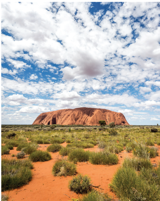
We visit the Aboriginal site of Uluru (Ayers Rock) on Day 8.