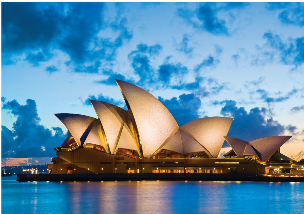
Sydney's iconic Opera House, which we tour on Day 12

Day 9: Ayers Rock/Sydney This morning we visit the base of Uluru and the interesting museum here. Mid-day we fly to Sydney, arriving late afternoon. B,D