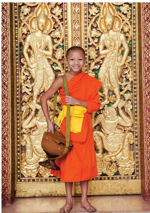
Young Buddhist monk stands at temple door.