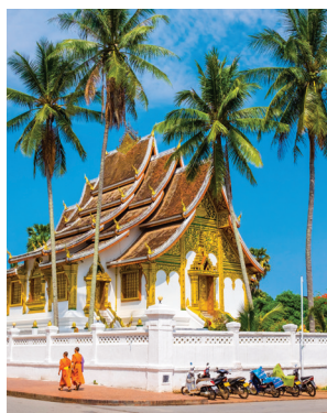
Royal Palace, Luang Prabang

Day 16: Chiang Rai/Bangkok Today we visit the Doi Tung Royal Villa and Gardens, the former home of the king’s mother who led efforts against the heroin trade. Late today we fly to Bangkok. B,L,D