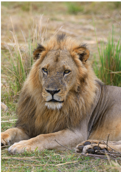
Taking a break ...