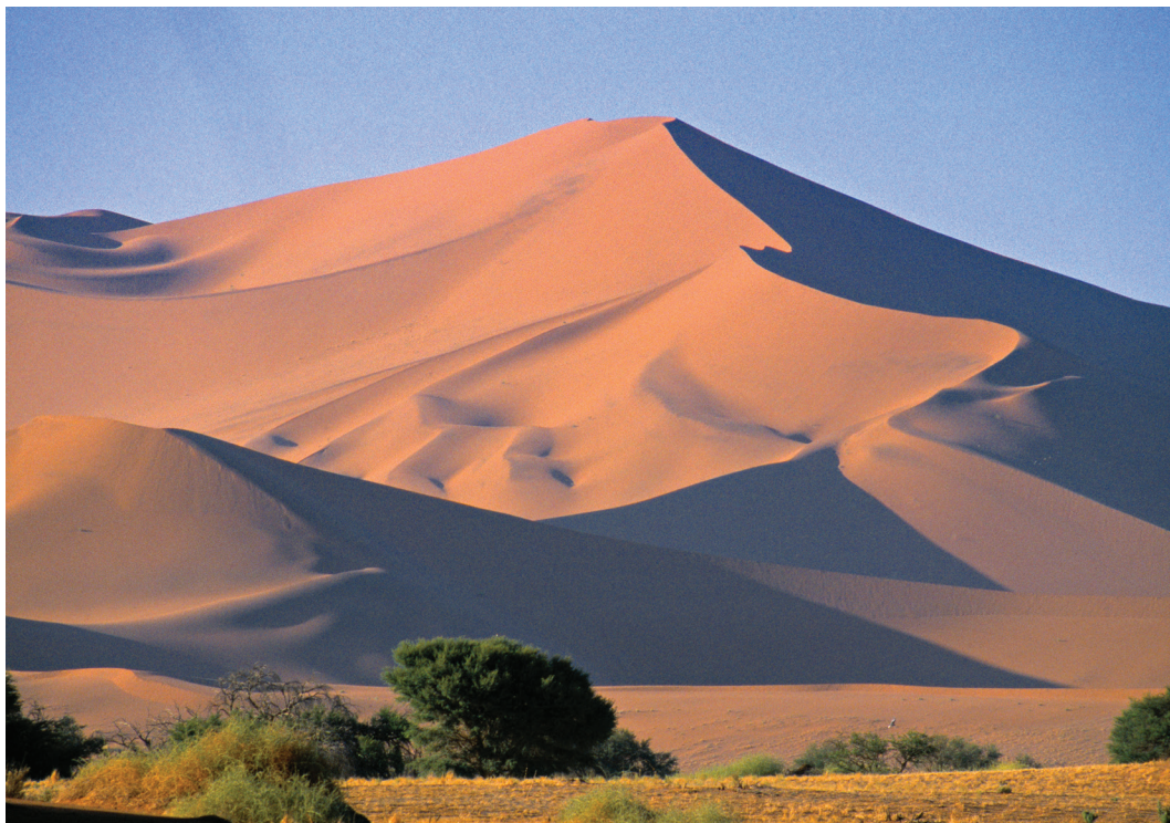
We explore the crested dunes at Sossusvlei, among the world's highest at 1,300 feet.

in all Africa, including the world's largest elephant population (some 120,000), as well as zebra, lion, hippo, giraffe, impala, wildebeest, buffalo, and more. We're sure to see some of them on today's full-day excursion to Chobe, where we take a morning game drive and an afternoon game cruise. B,L,D