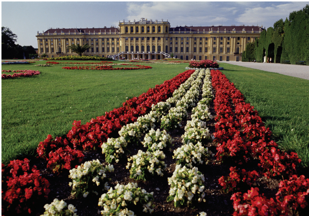
We visit Vienna's majestic Schönbrunn Palace on Day 11.

Day 6: Krakow This morning we tour the Wieliczka Salt Mine, a UNESCO World Heritage site that is a virtual underground city, with galleries, lakes, chapels, and murals – all carved from salt. The mine's centerpiece is the Chapel of Saint Kinga, with its chandelier and mural of The Last Supper , carved by three miners over a period of 68 years. Then we return to Krakow, where the remainder of the day is free for independent exploration, with lunch and dinner on our own in this historic capital. B