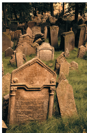
Prague's ancient Jewish Cemetery

Day 14: Prague We spend the morning exploring the Hradcany (castle) district, home of the distinctive castle towering above the Vltava River. Dating to the 9 th century, the castle today is the seat of the president of the Czech Republic. Among the highlights of our tour: a visit to Gothic St. Vitus Cathedral and a stroll