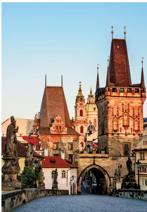
Prague's Charles Bridge dates to 1357.