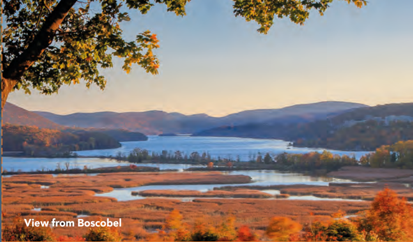
View from Boscobel