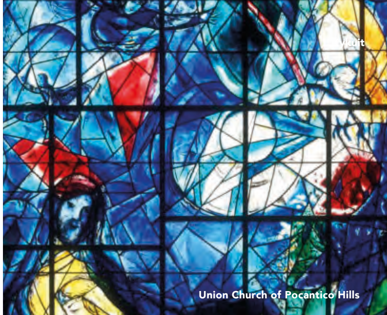
Union Church of Pocantico Hills