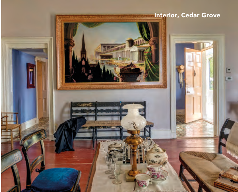
Interior, Cedar Grove