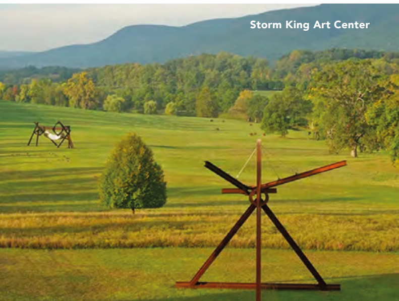
Storm King Art Center