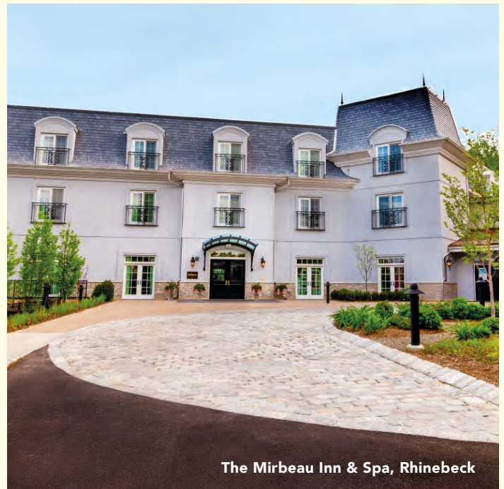
The Mirbeau Inn & Spa, Rhinebeck