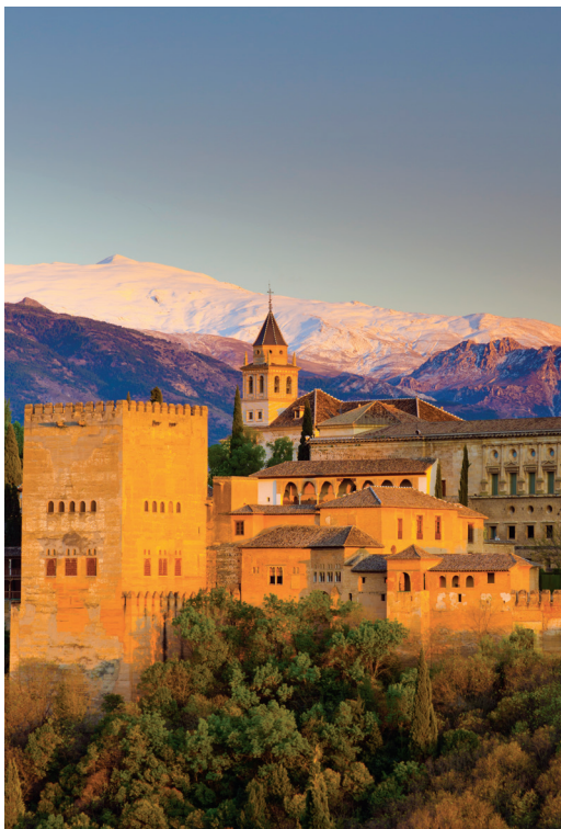
On Day 11, we visit Granada's Alhambra.