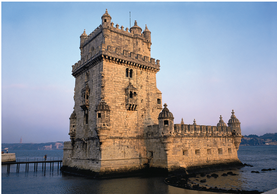
We see iconic Belém Tower, the most photographed monument in Portugal, on Day 3.

region and city of beauty and romance. This is the place that inspired Carmen and Don Giovanni ; where fragrant orange trees and flower-bedecked balconies delight the senses; and home of the renowned Cathedral, the world's largest Gothic building. After a tour that includes the Alcázar palace and the Arab quarter, the afternoon is free to explore independently. We return to Carmona late afternoon and dine at our parador this evening. B,D