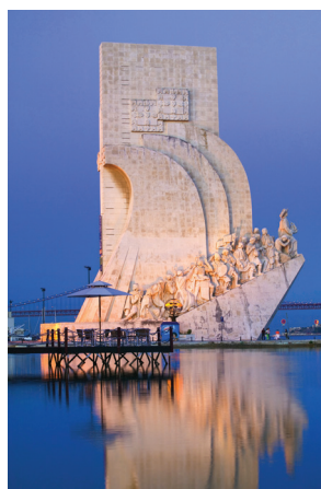
Lisbon's Monument to the Discoveries

Day 13: Madrid Our morning tour of this monumental and dignified capital city includes vast