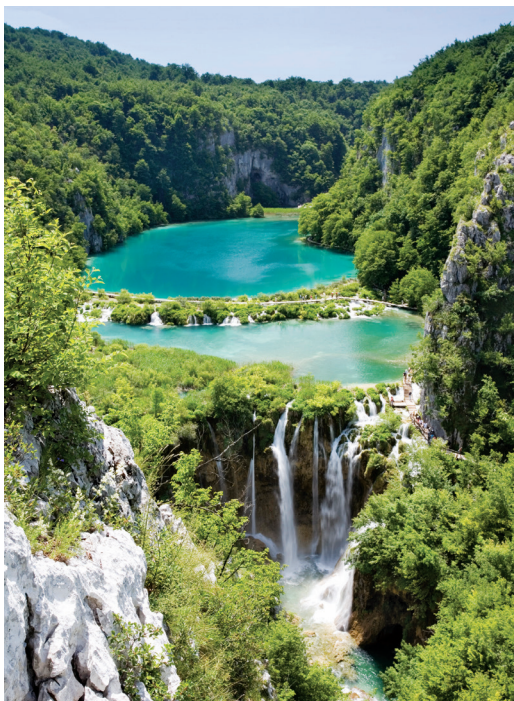
We visit Plitvice Lakes on Day 9.