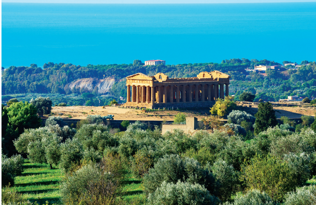
We see the Temple of Concordia on Day 6 while exploring the Valley of the Temples.

and almond trees. Here we visit the city's celebrated cathedral, another gem of Arab-Norman Palermo and one of the finest examples of Norman architecture still in existence. The imposing main façade and ornate outer cloister serve to prepare us for the cathedral's breathtaking main sanctuary, where every inch of wall and ceiling space is covered with painstakingly detailed mosaics. Crafted by artisans from Constantinople (now Istanbul), the dazzling mosaics contain some 4,850 pounds of pure gold. Next we visit a nearby family-owned winery, where we enjoy a wine tasting and lunch. Our journey then continues; late this afternoon we reach Agrigento and our hotel, where we dine together tonight. B,L,D