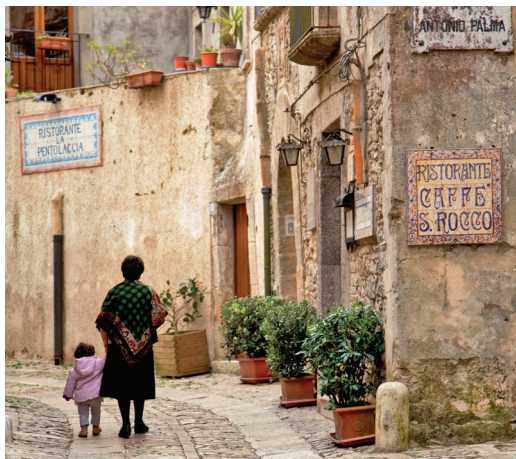
Palermo street scene

Day 12: Depart for U.S. We transfer today to the Catania airport for our return flight to the U.S. B