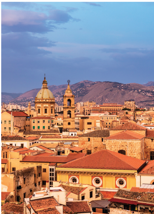
The sun rises over the city of Palermo.