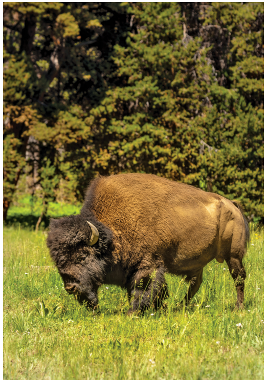
Bison – symbol of the American West

Day 7: Cody/Yellowstone National Park/Grand Teton National Park/Jackson Hole More stunning Western scenery is on offer today as we traverse two of America's great national parks. This morning we re-enter Yellowstone, seeing first Yellowstone Lake. The park's largest body of water, Yellowstone Lake offers beautiful panoramic views. We have time for lunch on our own in the park before continuing on to world-famous Old Faithful. One of the most predictable geothermal features on Earth, Old Faithful