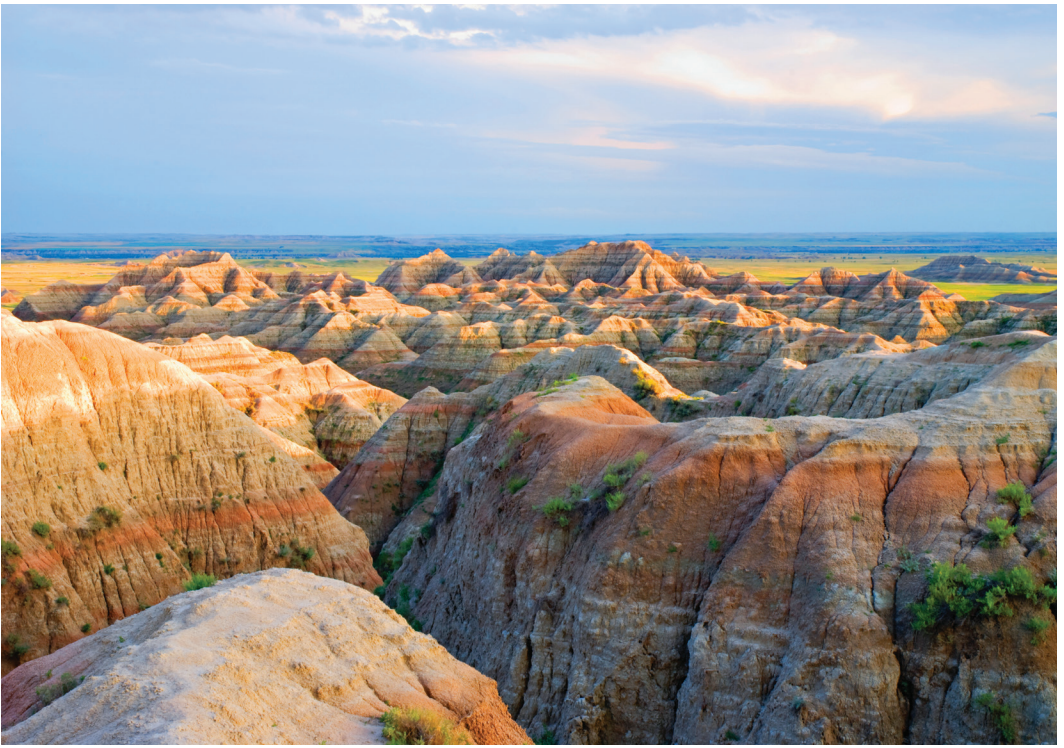
We experience the dramatic landscape of Badlands National Park on Day 2.

cowboy still performs many of the same duties that his predecessors did two and three centuries back. During our visit we meet the cowboys and ranch hands and learn about their way of life. Then we enjoy a barbecue lunch before returning to Sheridan, where we tour the Kendrick Mansion, a restored cattle baron's home at Trail End State Historic Site. The rest of the afternoon is at leisure in this classic Western town. Tonight we enjoy dinner together. B,L,D