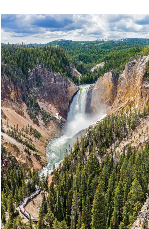
Yellowstone’s Lower Falls, a UNESCO site