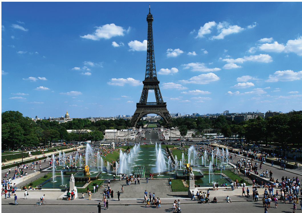
Discover Paris with its iconic Eiffel Tower.

some of Sarlat’s museums or art galleries – or simply to wander the atmospheric cobblestone streets. After lunch on our own we visit nearby Rocamadour, a revered pilgrimage site and medieval village whose three tiers cling almost impossibly to a sheer limestone cliff. We take a guided walking tour then enjoy some free time before we return to Sarlat mid-afternoon and dine together tonight. B,D