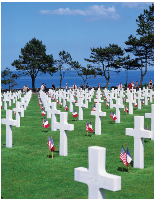
On Day 12, we visit the American Cemetery at Omaha Beach.