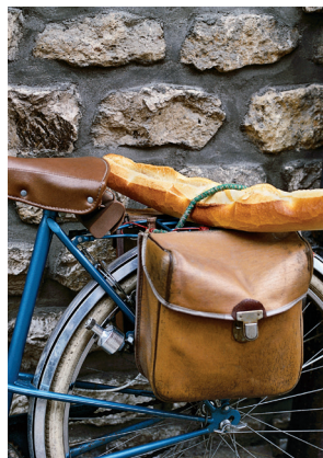
Typical French scene

Day 13: Crépon/Giverny/Paris This morning we visit the village of Giverny and the home and gardens