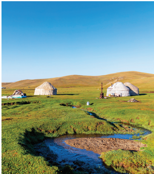
Typical Kyrgyz yurts