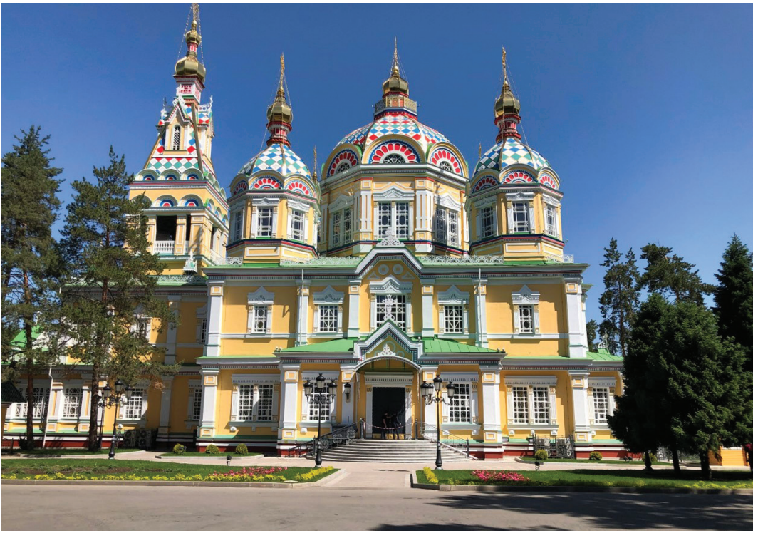
Almaty's Ascension Cathedral, which we visit on Day 6

crafts, including embroidery, jewelry, ceramics, and carpets. We have free time this afternoon before dinner at a local restaurant. B,L,D