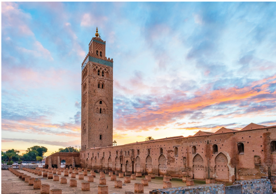
We see the distinctive Koutoubia Mosque – Marrakech’s largest – on Day 11.

Day 6: Fez We begin today with a walk through the medina and a visit to the Al-Attarine Madrasa, whose highlight is a small courtyard showcasing intricately detailed tilework and carving decorations. Then we embark on a walking tour of the medina focusing on the artisans’ quarters, the 14 th -century Koranic schools, and Al Karaouine, the medieval theological university. After lunch on our own, we visit the Borj Nord Arms Museum, an authentic Saadi fort that dates from 1582 and one of Morocco’s only European-influenced forts. After exploring the Moroccan armaments here, we are free this afternoon for independent exploration or relaxation. Tonight, we enjoy a private dinner at an intimate family-run riad in Fez. B,L,D