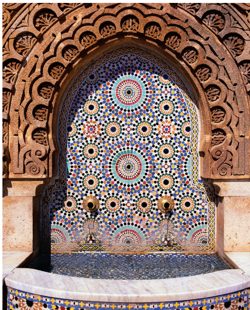
Traditional Moroccan tile work

Day 10: Ouarzazate/Ait ben-Haddou/Marrakech En route to Marrakech today, we stop first at uninhabited Ait ben-Haddou, a UNESCO World Heritage