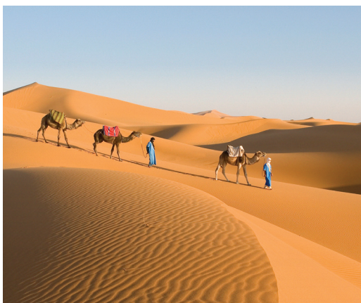
We ride camels in the Sahara.

to non-Muslims. Tonight we celebrate our Moroccan adventure at a farewell dinner at a local restaurant. B,D