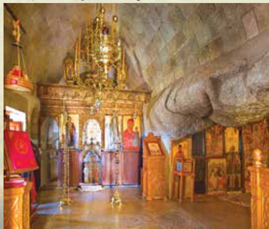
See the Cave of the Apocalypse, the home of St. John the Apostle during his exile.

The island of Rhodes, the largest of the Dodecanese islands, has been one of the most prosperous and strategic strongholds in the eastern Mediterranean since the Neolithic Period. Dock at the fortified wall of Rhodes Town, a UNESCO World Heritage site, and step into arguably Europe's most impressive continuously inhabited medieval walled city—built over a great Hellenistic metropolis and a major Christian outpost during the Crusades.