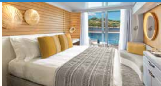
Stateroom with Balcony