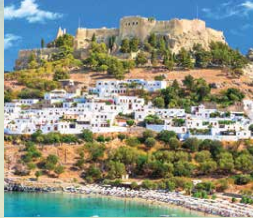
Be inspired by spectacular coastal views from the Lindos Acropolis, built 380 feet above the town.

Today Mykonos' iconic 16 th -century windmills, bright-white cubist Cycladic architecture, picturesque harbor and azure bays epitomize the striking beauty of the Greek Isles.