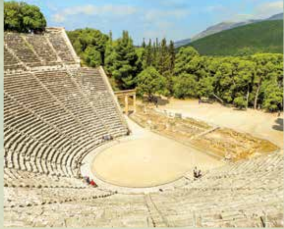
Enjoy the near-perfect natural acoustics of the theater at Epidaurus, built in the fourth century B.C.

Visit the splendid 14 th -century Palace of the Grand Masters, built by the Knights of St. John and a rare example of Gothic architecture in Greece.