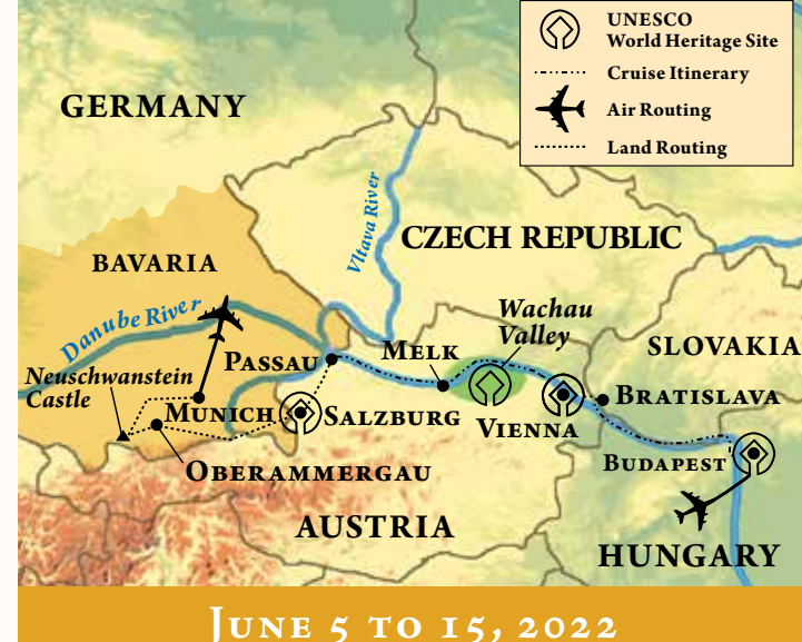
Hungary ♦ Slovakia ♦ Austria ♦ Germany