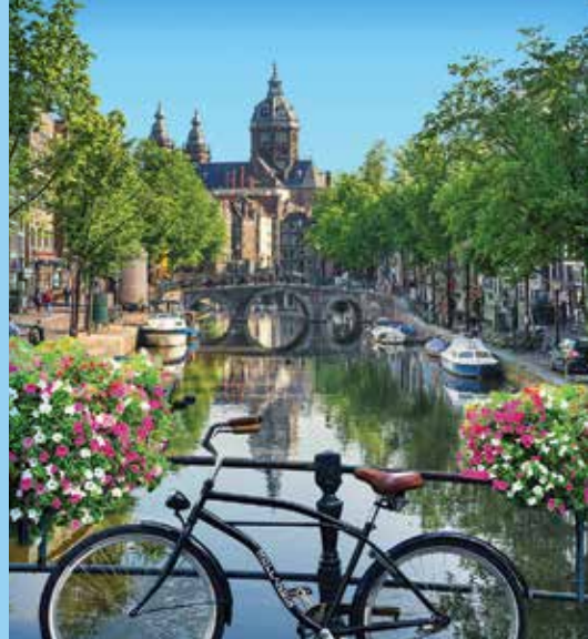
Amsterdam's bridges and canals bring the intimacy of a small town to one of Europe's most celebrated cities.