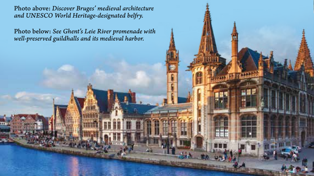
Photo below: See Ghent's Leie River promenade with well-preserved guildhalls and its medieval harbor.

Photo above: Discover Bruges' medieval architecture and UNESCO World Heritage-designated belfry.