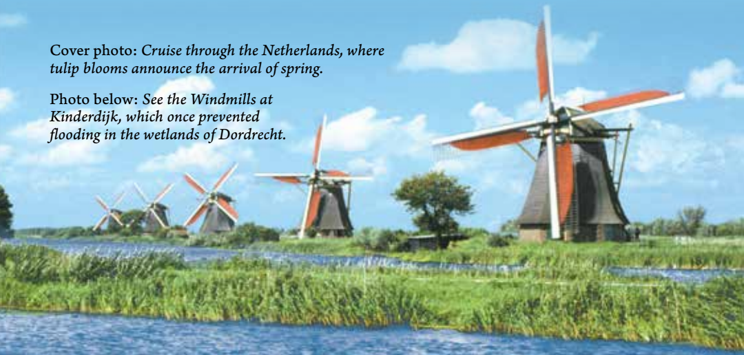
Photo below: See the Windmills at Kinderdijk, which once prevented flooding in the wetlands of Dordrecht.

Cover photo: Cruise through the Netherlands, where tulip blooms announce the arrival of spring.