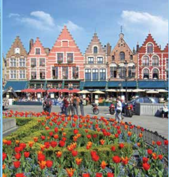
The lively, medieval Market Square is the principal city square and gathering point in Bruges.