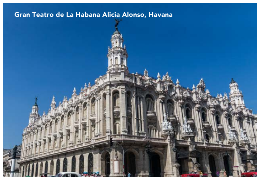
Gran Teatro de La Habana Alicia Alonso, Havana

NOT INCLUDED IN RATE International airfare; Cuban visa; Cuban Departure tax; limited Cuban health insurance policy (required for all foreign travelers to Cuba under age 80); passport fees; alcoholic beverages other than as noted in inclusions; personal items and expenses; travel insurance; excess baggage; airport transfers other than for those on suggested flights; travel insurance; any other items not specifically mentioned as included.