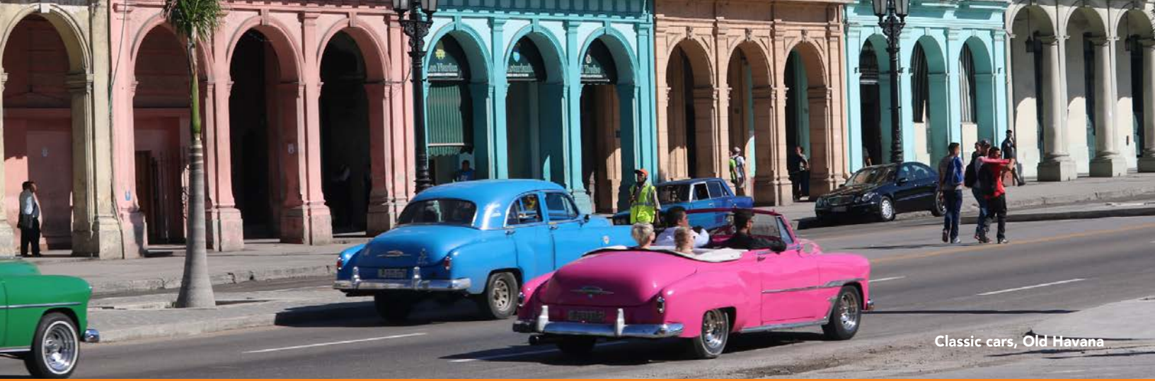
Classic cars, Old Havana