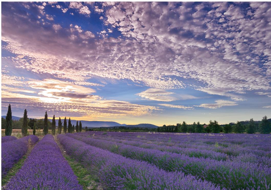
Fragrant fields of lavender color – and perfume – the Provençal landscape.

Day 6: Saintes-Maries-de-la-Mer Our exploration of the Camargue begins with a visit to a manade , a traditional ranch where gardians (cowboys) raise bulls both for meat and to perform in local arenas. We learn about the traditional way of life as we tour the manade , watch the gardians manage their herds while on horseback, and enjoy a lunch of local specialties. Then we head to the Pont de Gau ornithological reserve in the heart of the Camargue Regional Natural Park. We're likely to see the pink flamingos for which the park is known, as well as species of heron, birds of prey, and seasonal migratory birds. B,L