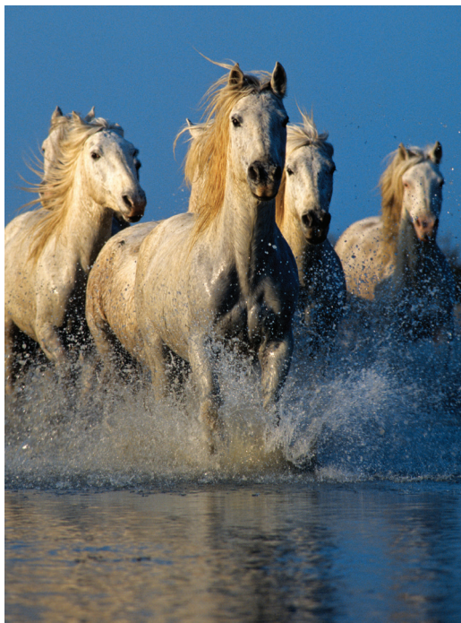
The Camargue's unique white horses