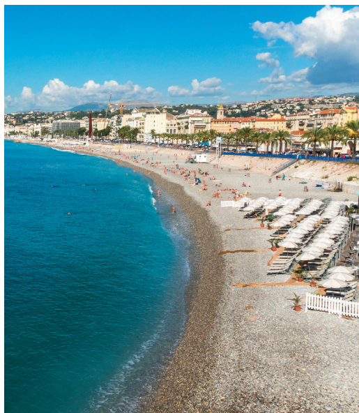
Nice's iconic Promenade des Anglais

Day 12: Depart for U.S. Today we depart for the Nice airport and our return flights to the U.S. B