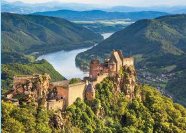
Cruise along the Danube River through the stunning natural beauty of the Wachau Valley landscape, a UNESCO World Heritage site.