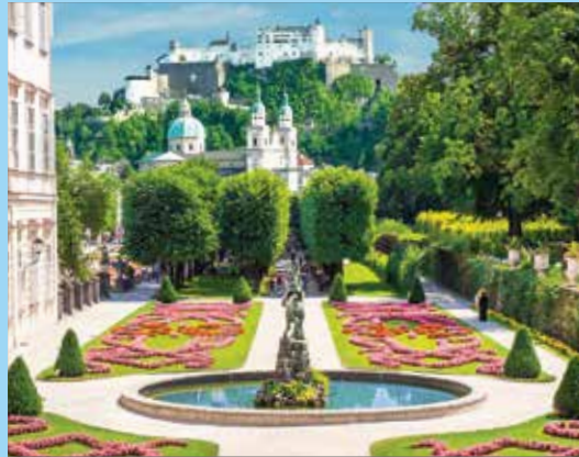
Stroll through the Baroque pleasure gardens of Mirabell Palace in the heart of Salzburg.

After lunch on board the ship, visit the UNESCO World Heritage-designated