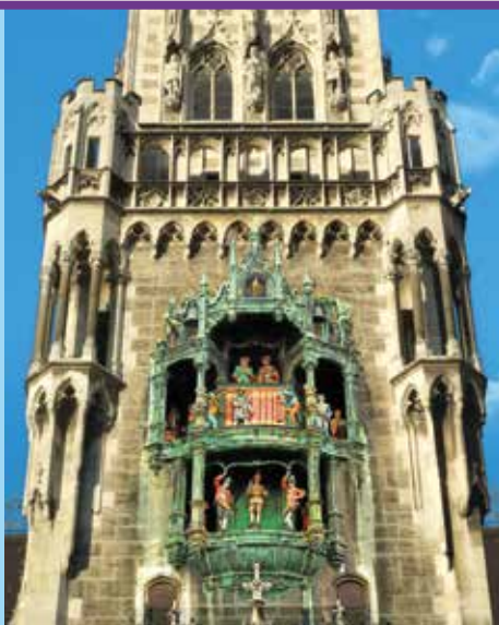
Delight in the reenactments of two scenes from Munich's history in the Glockenspiel on the city's town square, Marienplatz.

After breakfast, continue on the Berlin and Potsdam Post-Program Option or transfer to the airport for your return flight to the U.S.