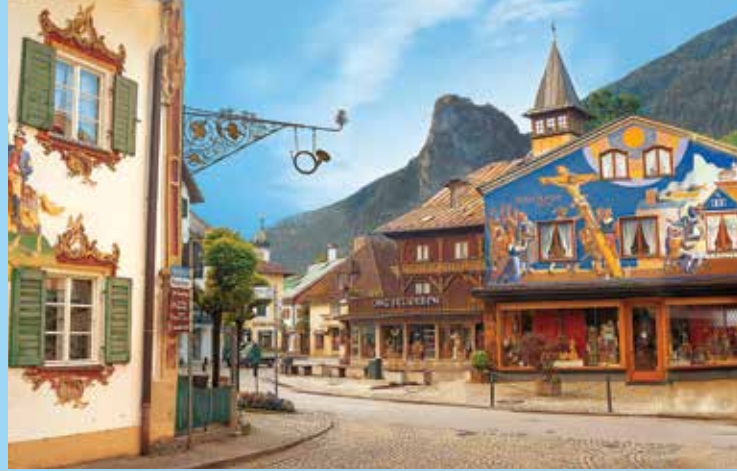
Enjoy the charm of Oberammergau, with painted trompe l'oeil frescoes on many homes and shops, depicting fairy tales and religious scenes.