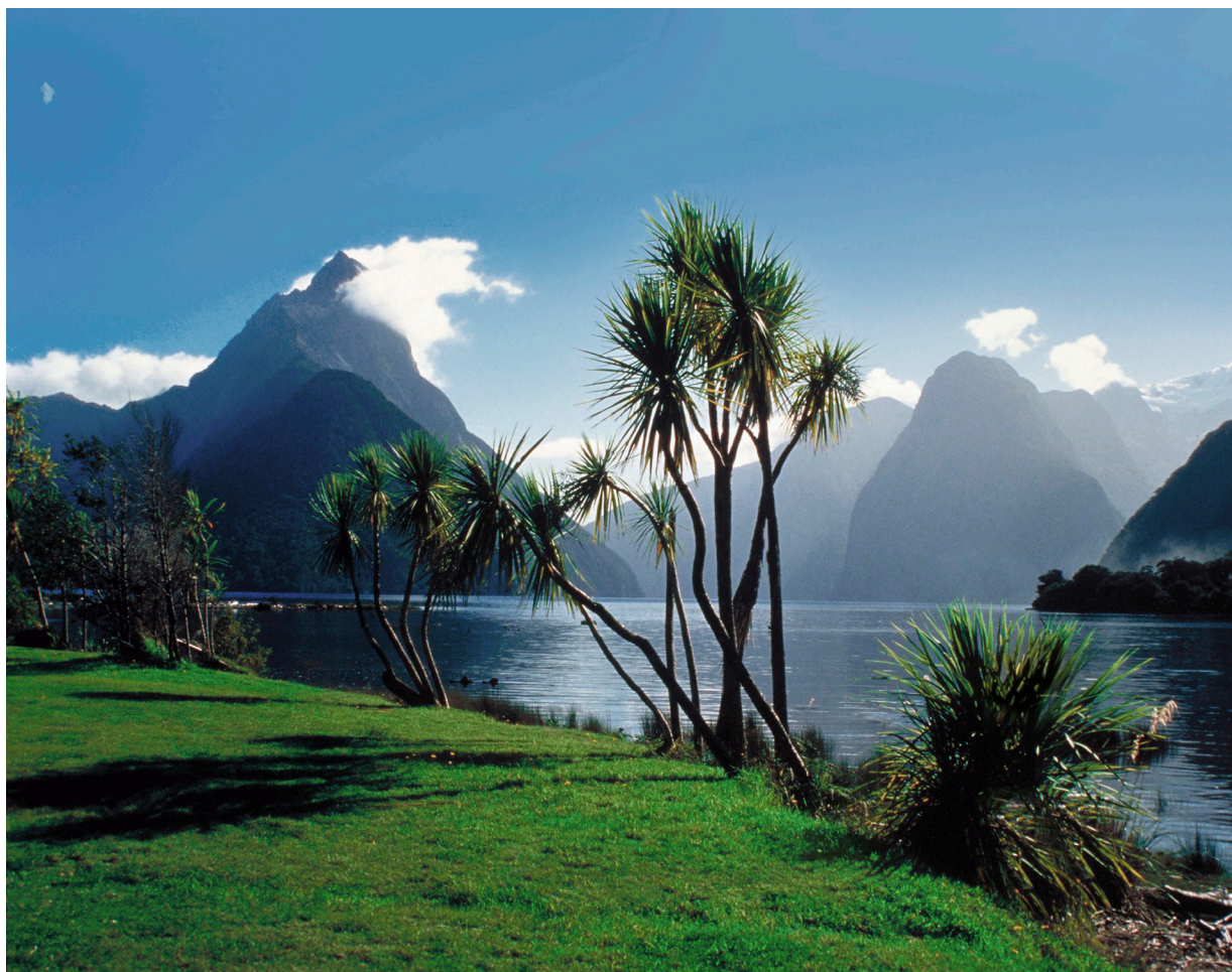
On Day 16, we see for ourselves why serene Milford Sound ranks as New Zealand’s most popular destination.