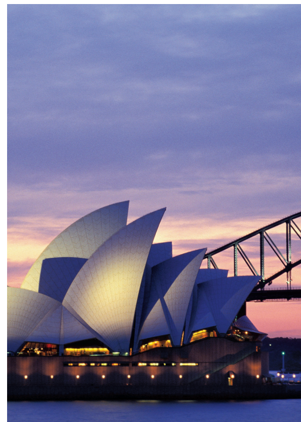
The Sydney Opera House and Harbour Bridge at dusk

Day 22: Depart for U.S. Very early this morning we depart for the airport for the flight to Los Angeles (via Sydney) and our return flights home. B