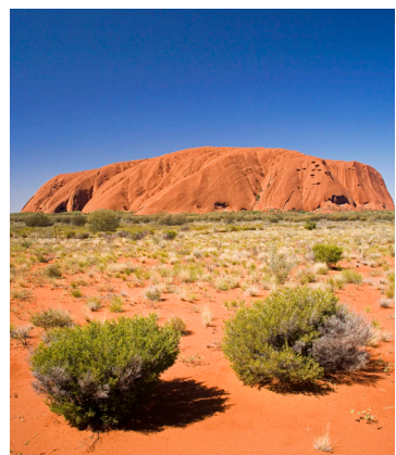
Aboriginal site of Uluru (Ayers Rock)

Day 14: Mount Cook This morning's tour of alpine Mount Cook Village includes a visit to the Sir Edmund Hillary Alpine Center, where we see a 3D planetarium movie about the region. We also visit the Hillary Gallery, commemorating Sir Edmund's