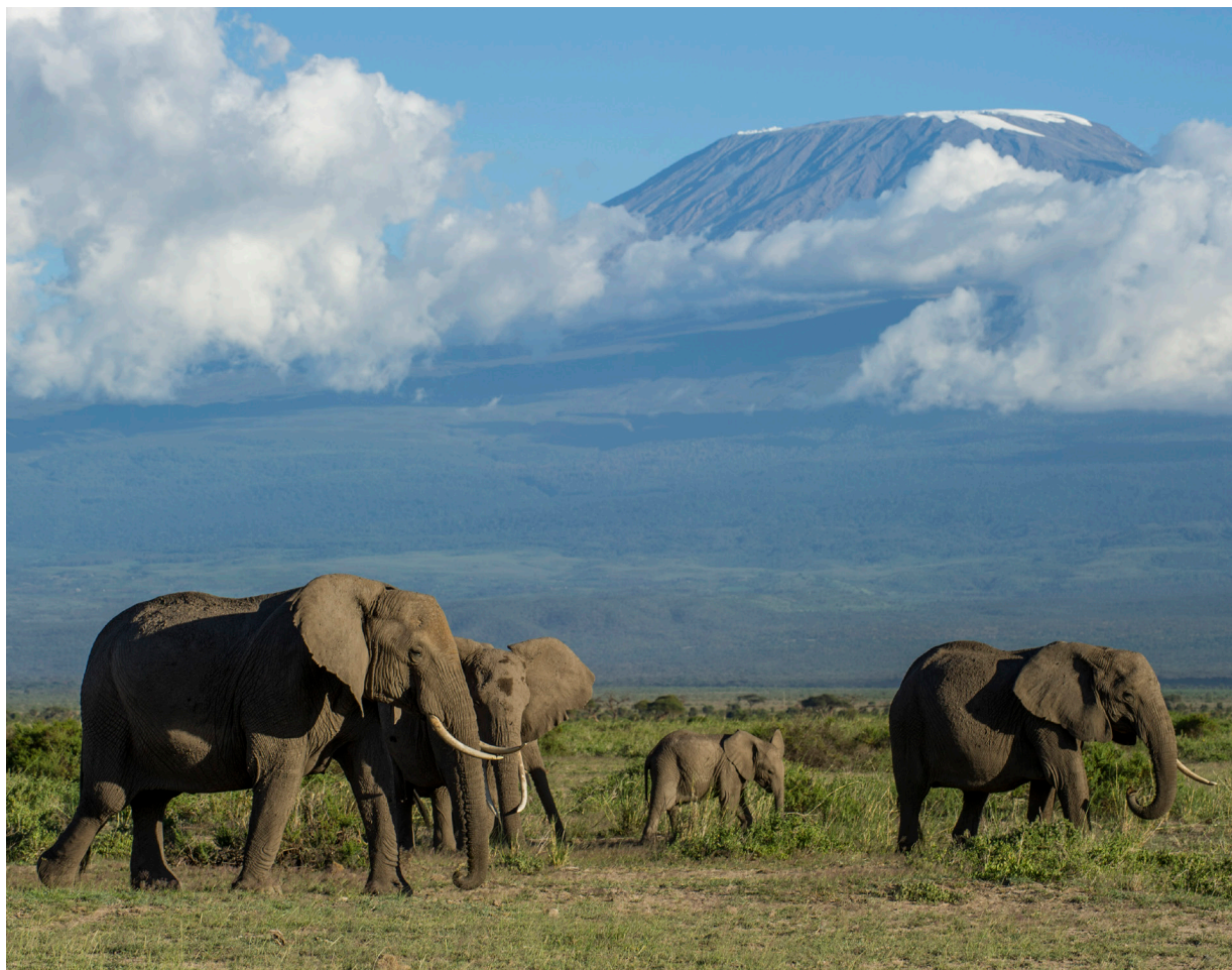
We go on safari in Kenya's Amboseli National Park, in the shadow of Mt. Kilimanjaro.