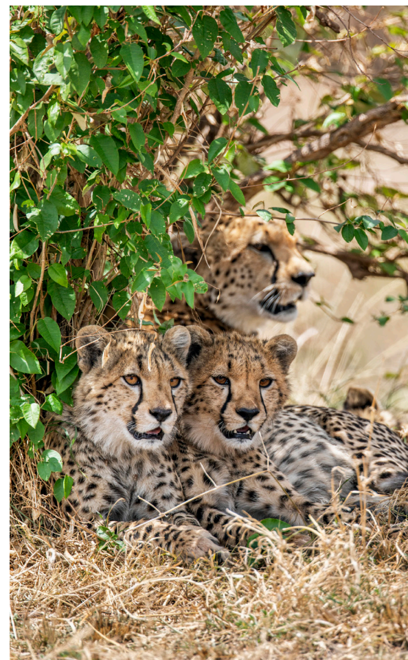
Cheetahs in Masai Mara