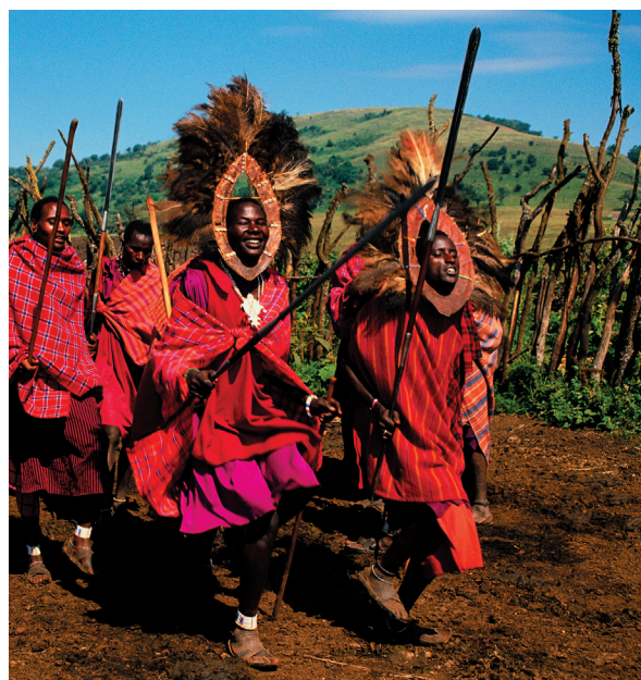
Kenya’s native Maasai people

Day 16: Arrive U.S. We reach the U.S. today and connect with our flights home.