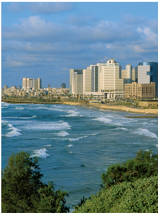
Sophisticated seaside Tel Aviv