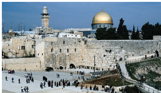
Devout Jews pray at Jerusalem’s Western Wall.

Day 12: Depart Tel Aviv for U.S. Very early this morning we transfer by motorcoach to Tel Aviv for our connecting flights to the United States. B