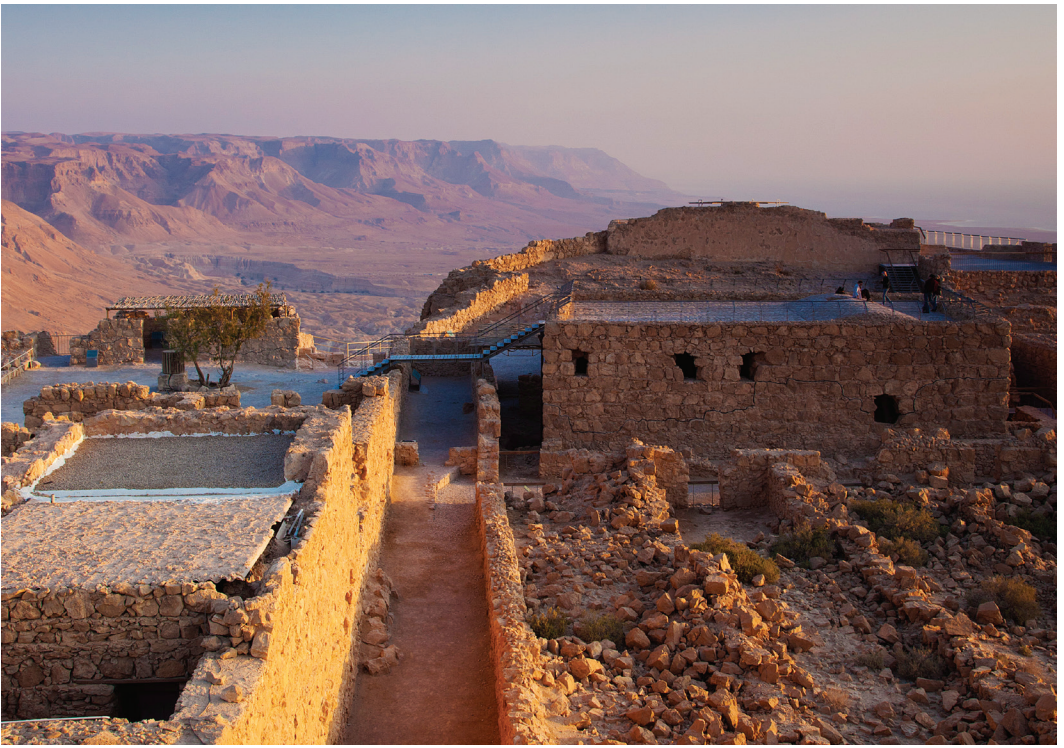
We explore the ruins at legendary Masada on Day 8.

church in the Middle East and where the archangel Gabriel told the Virgin Mary that she would give birth to Jesus. We enjoy lunch at a family-run dairy farm then continue to Safed, center of Jewish mysticism, home to many artists, and where we stroll the medieval streets. We visit some of the galleries here before returning to our hotel, where we dine tonight. B,L,D