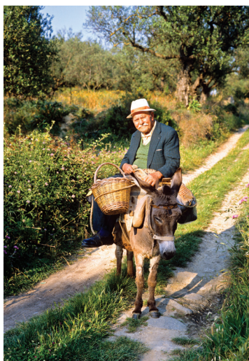
Old ways endure ...

Day 7: Nafplion/Hydra This morning we travel to the port of Ermioni, where we board a private boat for the ride to Hydra, the car-free Saronic island where donkeys provide the transportation. After lunch together at a local taverna, we have free time to enjoy this picturesque island as we wish. Late afternoon we return to Nafplion for an evening at leisure. B,L