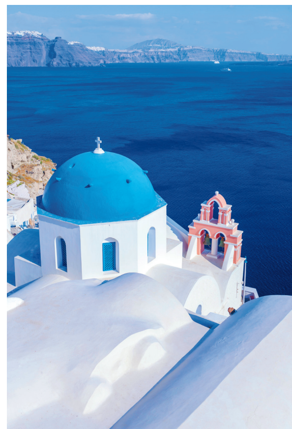
We spend two nights in idyllic Santorini.

Day 14: Depart for U.S. We transfer to Athens' international airport this morning, where we connect with our return flight home. B