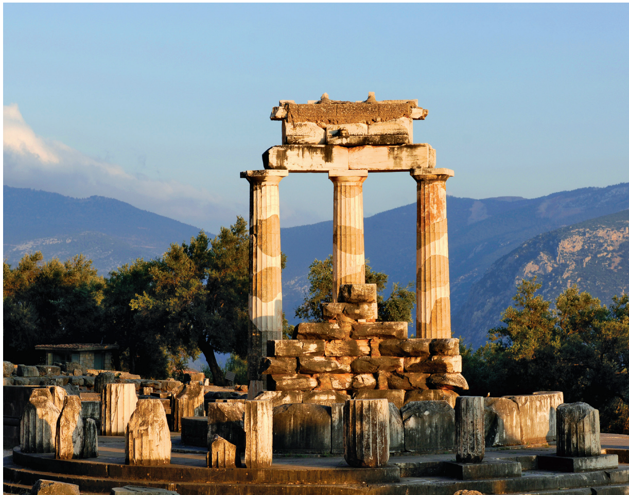
On Day 4, we tour the ruins of Delphi, believed by the ancients to be the “navel [center] of the world.”