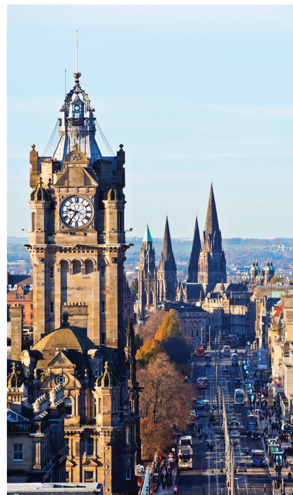
Edinburgh’s popular Princes Street