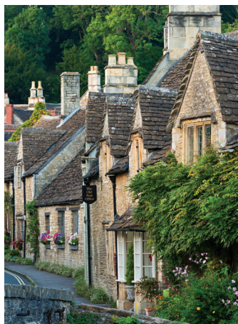
Charming Cotswolds cottages

Day 10: Stratford-upon-Avon/The Cotswolds/Bath Today we encounter the Cotswolds, England’s south central region of gently rolling hills dotted with