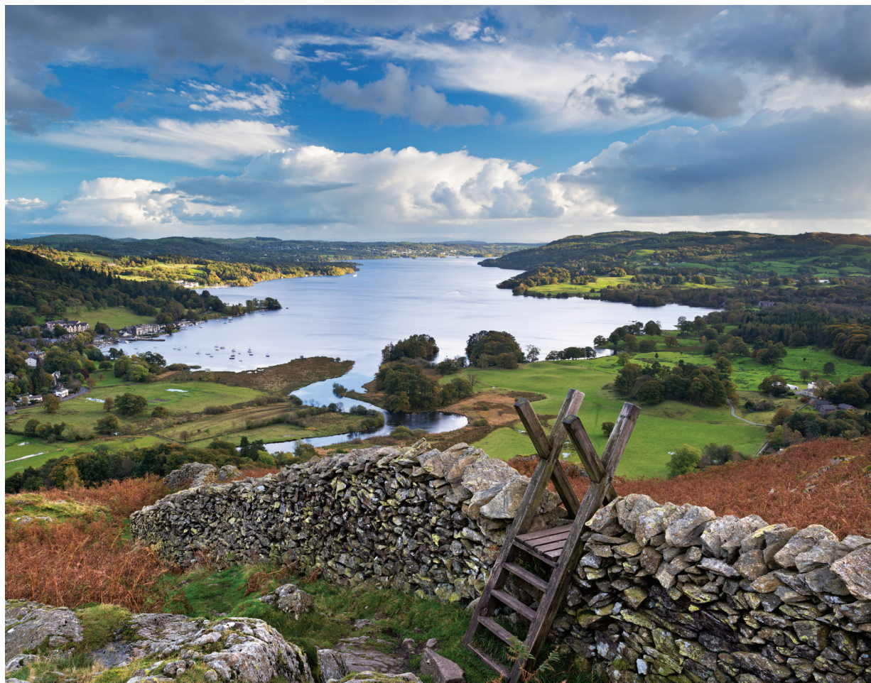
Now a UNESCO site, England's Lake District has drawn visitors since Wordsworth helped to spread the word in the early 19 th century.