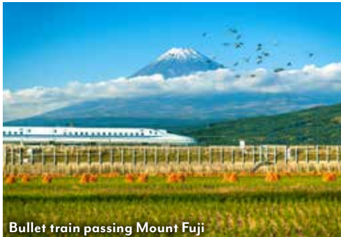
Bullet train passing Mount Fuji