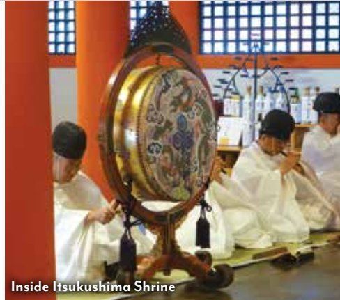
Inside Itsukushima Shrine