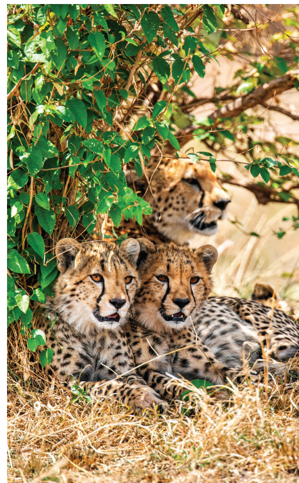
Cheetahs in Masai Mara