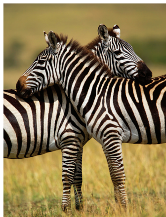
We’re sure to see zebra.

Day 11: Serengeti/Masai Mara We leave Tanzania today, crossing into Kenya and continuing on to Masai Mara by air. Kenya’s premier game reserve rich with animal life, the Mara is the traditional homeland of the native Maasai people. Known especially for the