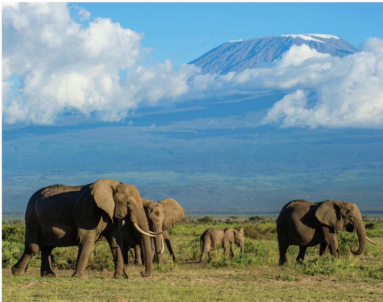
We go on safari in Kenya's Amboseli National Park, in the shadow of Mt. Kilimanjaro.