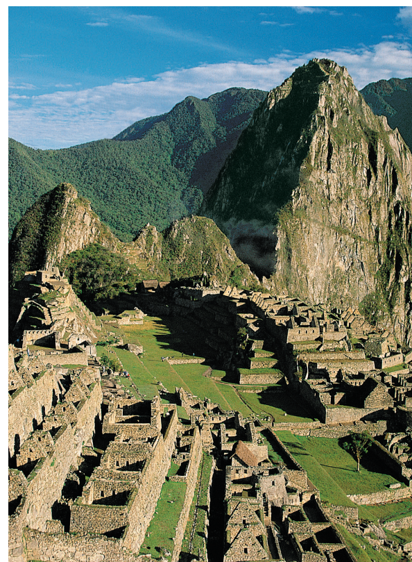
We explore the amazing ruins at Machu Picchu on Days 5 & 6.