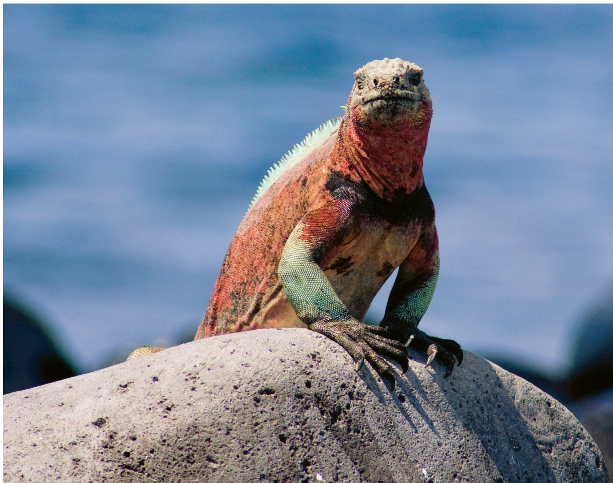
We're sure to encounter plenty of wildlife in the Galapagos, like this colorful marine iguana.

Ratings are based on the Hotel & Travel Index, the travel industry standard reference.