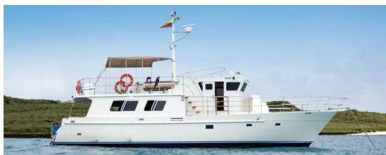
We stay in comfort for four nights in spacious rooms at the Royal Palm Hotel, set in the lush highlands of Santa Cruz island, and enjoy day cruises aboard the Santa Fe, our privately chartered yacht.