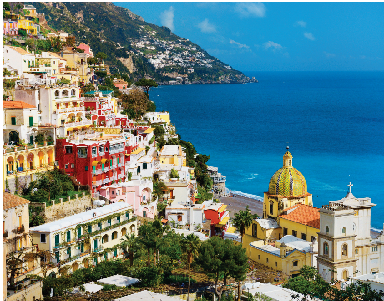
We spend three nights on the stunning Amalfi Coast, with its sheer cliffs, turquoise seas, and classic Mediterranean landscape.

From the breathtaking Amalfi Coast to eternal Rome, through the gentle Umbrian and Tuscan countryside to timeless Venice, this wide-ranging tour showcases ancient sites, contemporary life, priceless art, and beautiful natural scenery. You'll especially appreciate the small size of your group as you stay in unique accommodations in the Tuscan countryside and in a medieval village.