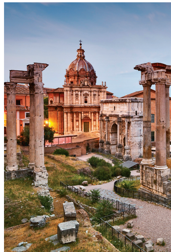
The Roman Forum dates to the 7 th century BCE.

Day 16: Depart for U.S. We depart early this morning for our connecting flights to the U.S. B